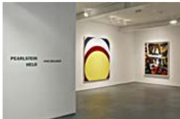
"Pearlstein / Held," installation view at Betty Cunningham Gallery

havoc with reflections. It's late mannerist virtuosity and some of his strongest work ever. Even if these tours de force first appear too busy, Pearlstein's staying power and his control over his medium and his ideas should humble younger artists.