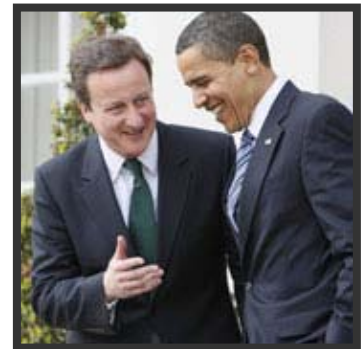
David Cameron & Barack Obama