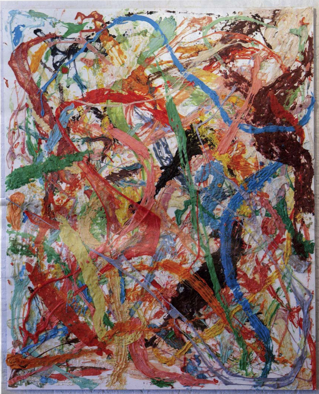
DAN COLE'S TO BE TITLED , 2010.