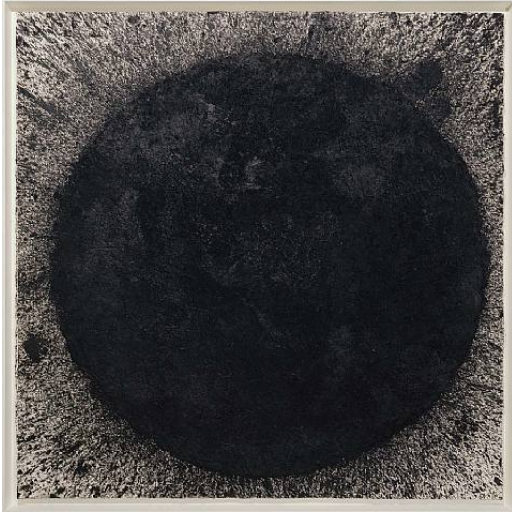
Richard Serra, Calvino (2009)

Currently showing at Gagosian Geneva, is Richard Serra's "Greenpoint Rounds," featuring large-scale drawings using a paint stick and showcasing a medium Serra is not often associated with. Primarily known for his sculptural work, Richard Serra plays on minimalism through methods that encompass both shape and texture. The gallery's rounded, sparse walls emphasize the shape and movement in the new drawings, which will be on display through May 15th.