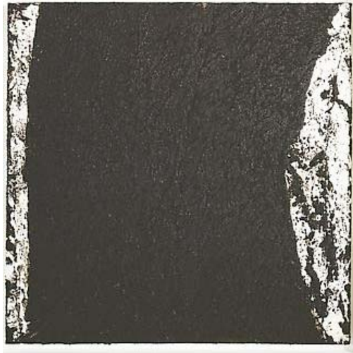
Richard Serra, Tracks #47 (2008)