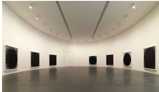
Richard Serra, “Greenpoint Rounds”

In terms of tone, the show is both bleak and inspiring. The monotony and large scale of Serra’s drawings make reference to infinity, or perhaps an eternity where destruction and creation coexist. The awesome nature of the work is emphasized by the attention to texture, form and scale.