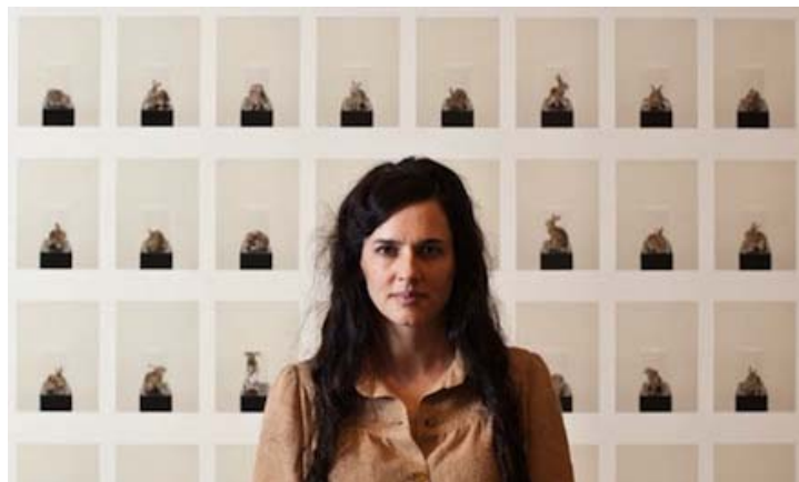
Taryn Simon in front of an excerpt from A Living Man Declared Dead and Other Chapters (2011)

Young photography star Taryn Simon opened her solo exhibition, "A Living Man Declared Dead and Other Chapters" at London's Tate Modern on May 25th. The exhibition is composed of portraits displayed in horizontal rows of family trees according to bloodlines, which Simon researched over a four-year period. As the artist says, she's "drawn to projects that end up being incredibly laborious" – though the photos themselves only took two months to complete.