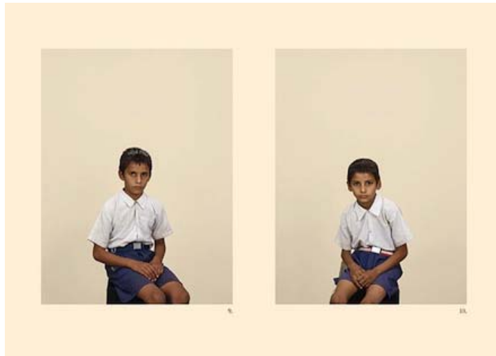
Taryn Simon, excerpt from A Living Man Declared Dead and Other Chapters (2011), via The Guardian.

Young photography star Taryn Simon opened her solo exhibition, "A Living Man Declared Dead and Other Chapters" at London's Tate Modern on May 25th. The exhibition is composed of portraits displayed in horizontal rows of family trees according to bloodlines, which Simon researched over a four-year period. As the artist says, she's "drawn to projects that end up being incredibly laborious" – though the photos themselves only took two months to complete.