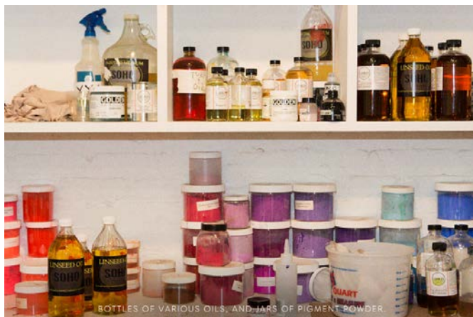
Bottles of various oils, and jars of pigment powder.

In late spring of 2013, with his works on display all over town, painter Dan Colen became the face of Millennial artists, a generation that hasn't had a discernable identity. At Frieze New York, Gagosian Gallery featured his oval, practically transparent sculpture comprised of glass basketball backboards. In the East Village, at Okó , a hole-in-the-wall satellite of Luxembourg & Dayan Gallery, Colen is exhibiting works inspired by Disney's Fantasia and by the Pre-Raphaelites (through June 15, 2013). And, at auction, the 33-year-old made record prices. Twenty-four hours after a tall, multi-hued floral canvas executed only last year realized $714,000 at a Christie's benefit organized by actor Leonardo DiCaprio, another large painting, covered with wads of red, blue, and cinnamon chewing gum, fetched $900,000 at Sotheby's.