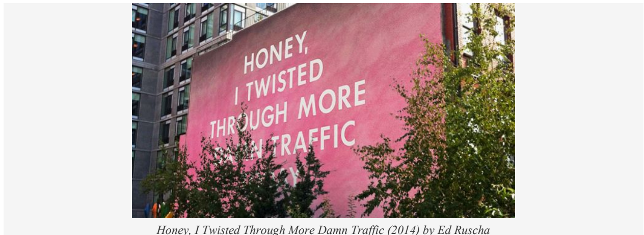
Honey, I Twisted Through More Damn Traffic (2014) by Ed Ruscha

Gallery goers should look out for works such as Gators , wherein Ruscha paints life-sized images of tire fragments that look like scraps of some deformed reptile. There’s also Psycho Spaghetti Western #14 , from a series that Ruscha began work on in 2010; these enlarge roadside detritus to a monumental scale, turning abandoned sofas and air-conditioning boxes into totems of decline; and there are also a few of his signature word paintings, such as the slightly ungrammatical, but fairly straightforward Inner-City Make Scream (2014).