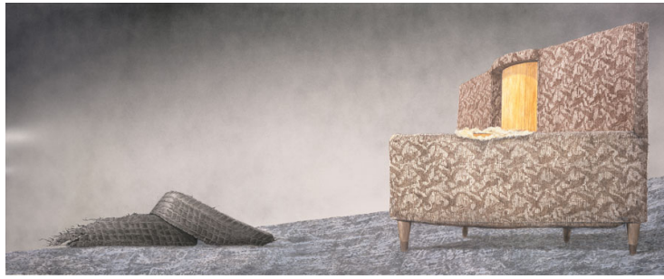
Psycho Spaghetti Western #14 (2013-14) by Ed Ruscha

Yet is Ed losing his love of life behind the wheel? That seems to be the implication of a new set of paintings going on show at the Gagosian in Rome tomorrow. The gallery describes these works as “complex pictures that conflate his signature elements with the visual devices, perspectival techniques, and refined atmospheres of Old Master paintings to depict the romantic road trip of youth reduced to roadside dystopia.”