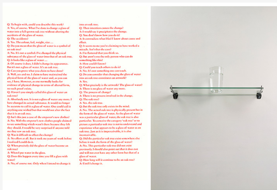
Michael Craig-Martin, An Oak Tree , 1973 Glass, water, shelf and printed text 5 7/8 x 18 1/8 x 5 1/2 inches (15 x 46 x 14 cm) © Michael Craig-Martin. Courtesy of the artist and Ggaosian Gallery.

Have you had any attention from the Church of Scientology? Is it difficult to stage a show called Clear in a city where the church is headquartered? No.