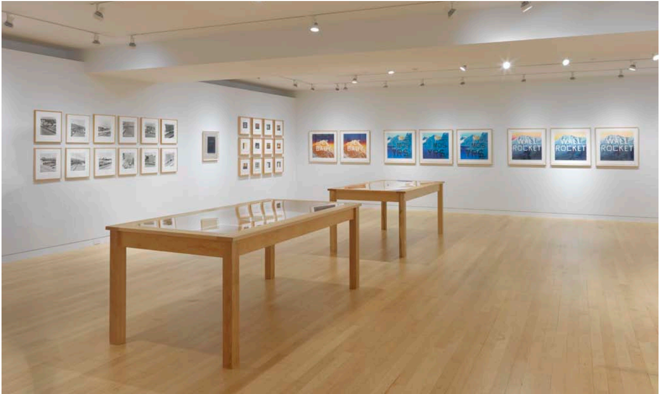
"Ed Ruscha: Prints and Photographs" installation view. ©Ed Ruscha.

in which words of certainty ("definite," "correct," "true," etc.) materialize against raking grids that suggest colored light refracted through a window. Collectively titled That Is Right (1989), the lithographs were produced at Hamilton Press in Venice, Calif. Ed Hamilton was one of many printers represented in the show;