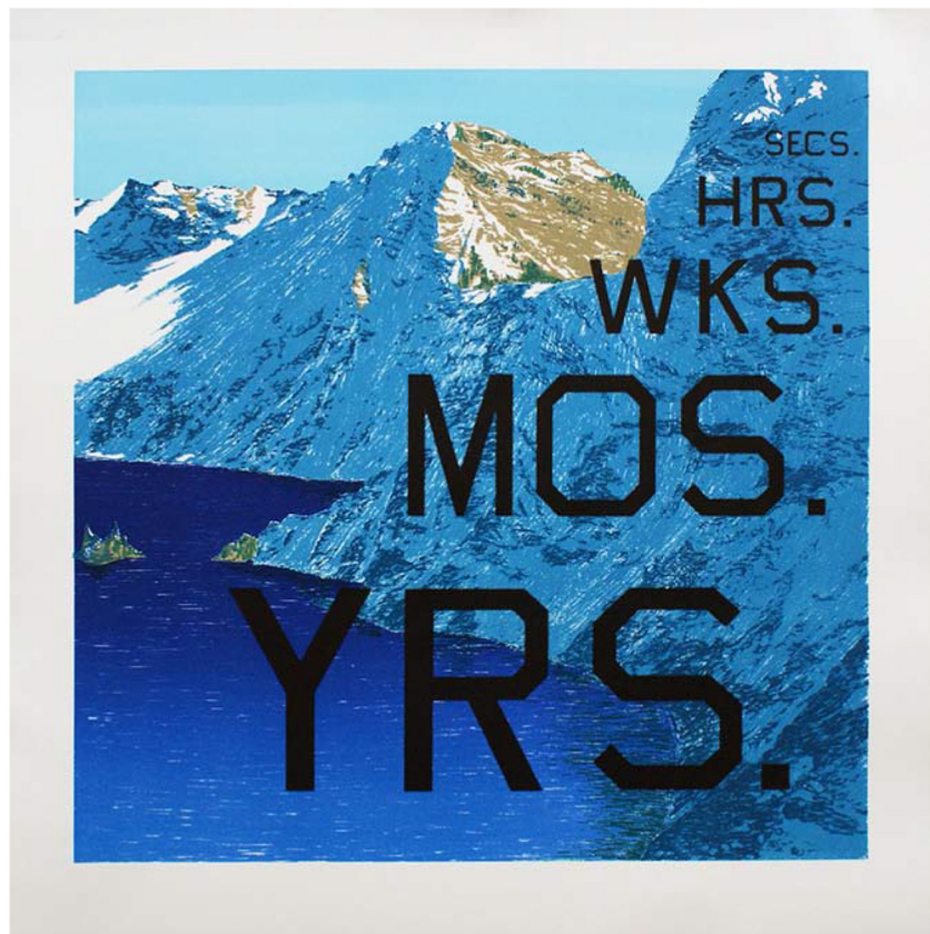
Ed Ruscha, Periods (2013), lithograph, 73 x 71.1 cm. Edition of 60.