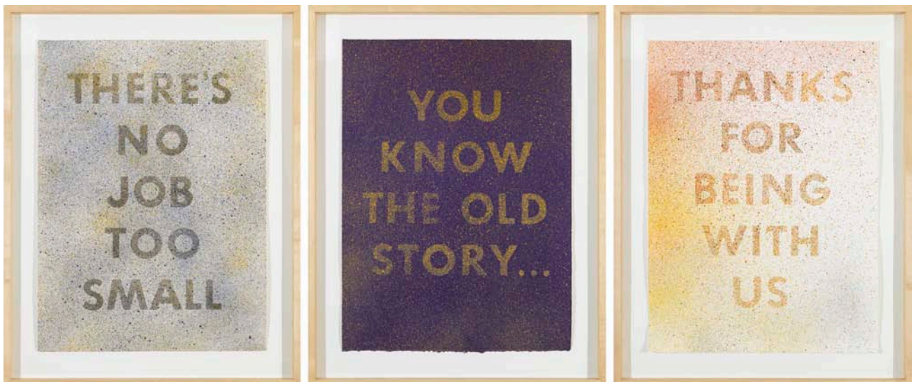
Ed Ruscha, Tamarind Set (1975), three color lithographs, 76.2 x 55.9 cm each. Edition of 35. ©Ed Ruscha.

By 1999, Engberg's catalogue raisonné had logged 374 prints of one sort or another and 17 books, but many more have appeared since. And that show did not include photographs meant to be viewed as such, rather than in books. At Gagosian, the placement of groups of