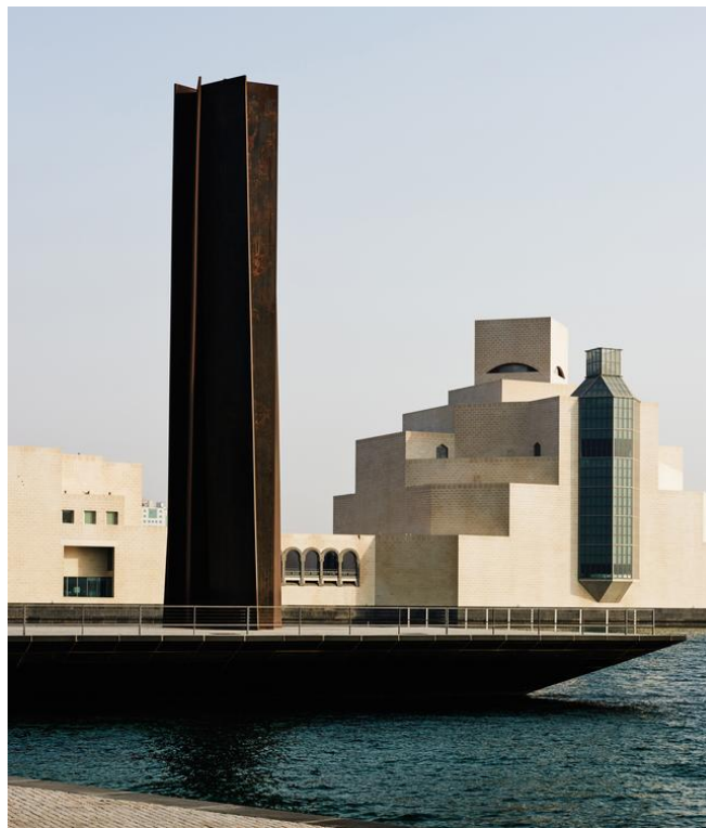
2011 sculpture ‘7’ in Doha, Qatar