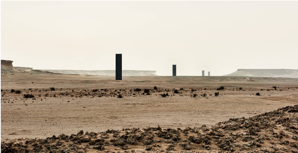
Serra's work 'East-West/West-East'

IN THE TINY GULF NATION of Qatar, an hour's drive west of the capital of Doha, amid miles of hazy hot sand, the artist Richard Serra last year planted a row of four thin, steel plates. Each one of these rectangular planks shoots straight up nearly five stories tall, and collectively they span a distance of roughly half a mile. From afar, these slats project an alien beauty, as though a mysterious shrine has been staked into a blanched expanse. Serra's truer intention becomes clear only close-up.