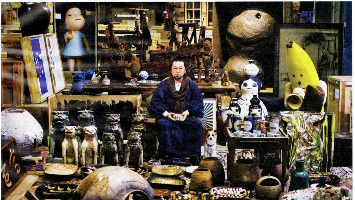
MURAKAMI, KAWAKI LTD. KIEFER, © ANSELM KIEFER, COURTESY OF GAGOSIAN GALLERY

Superstar artist provides exclusive insight into vast and eclectic collection before his Yokohama show – just don't call him the Japanese Andy Warhol