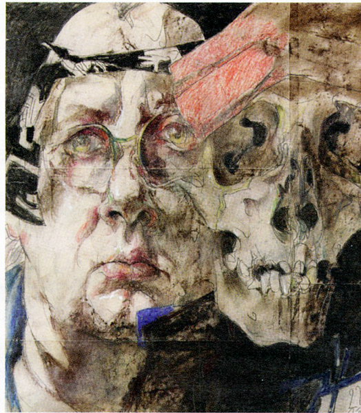
Murakami's first purchase was Horst Janssen's Self Portrait with Skull (1982). The Japanese artist's collection ranges from ink paintings by the 18th-century artist Shohaku to Friedrich Kunath's Starlite Walker (2011)