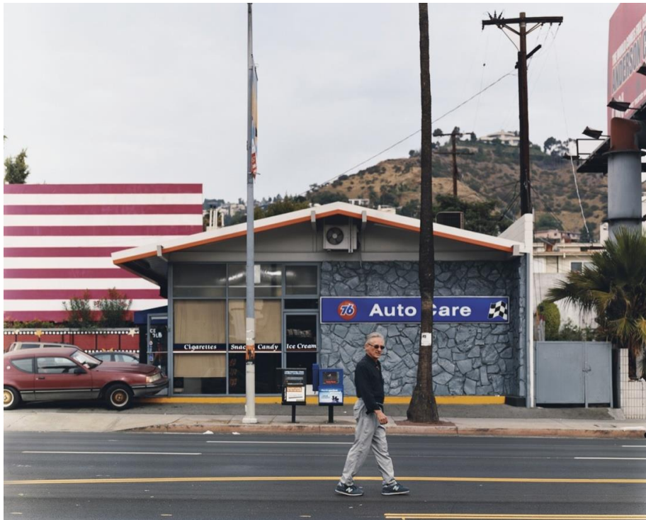
Ed Ruscha, November 8, 2003, West Hollywood, California.

There would be no art world without artists. It's nearly impossible to whittle down the many thousands if not millions around the world who have dedicated their lives in some way to an art practice; even in the art world, influence is ever more global and diffuse. But through combining the insight of Artsy's editors with data from UBS's art news app Planet Art and other sources, some trends do emerge for 2016. The artists who most captured the public's—and the media's—attention were primarily dealing with key issues of our time: political persecution, racism, sexism, and climate change. And they were privileging and engaging vast audiences with content, not flash. If this is any indication of the direction that the art world itself is headed in, then art is poised to be more relevant and powerful than ever. Below, in no particular order, are the most influential living artists of 2016.