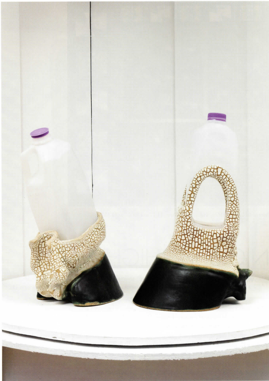
Lena Henke, split , 2016, clay, glaze, and plastic, 18" x 17" x 8", installation view. Real Fine Arts.

opulence for dazzling ingenuity and wit.