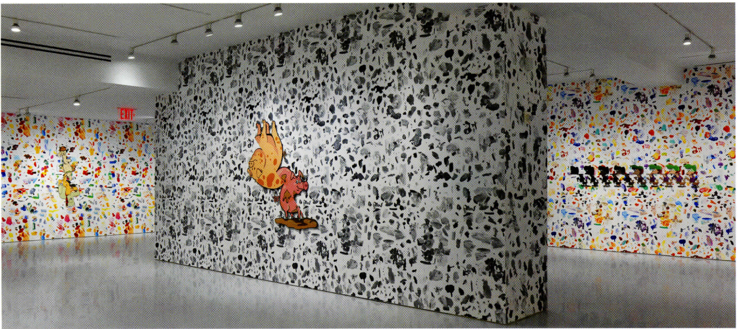
Urs Fischer, “Misunderstandings in the Quest for the Universal,” 2016, installation view. Gagosian.

release and learning that a “bioreactor” at 64th Street was controlling aspects of both shows deepened that feeling.