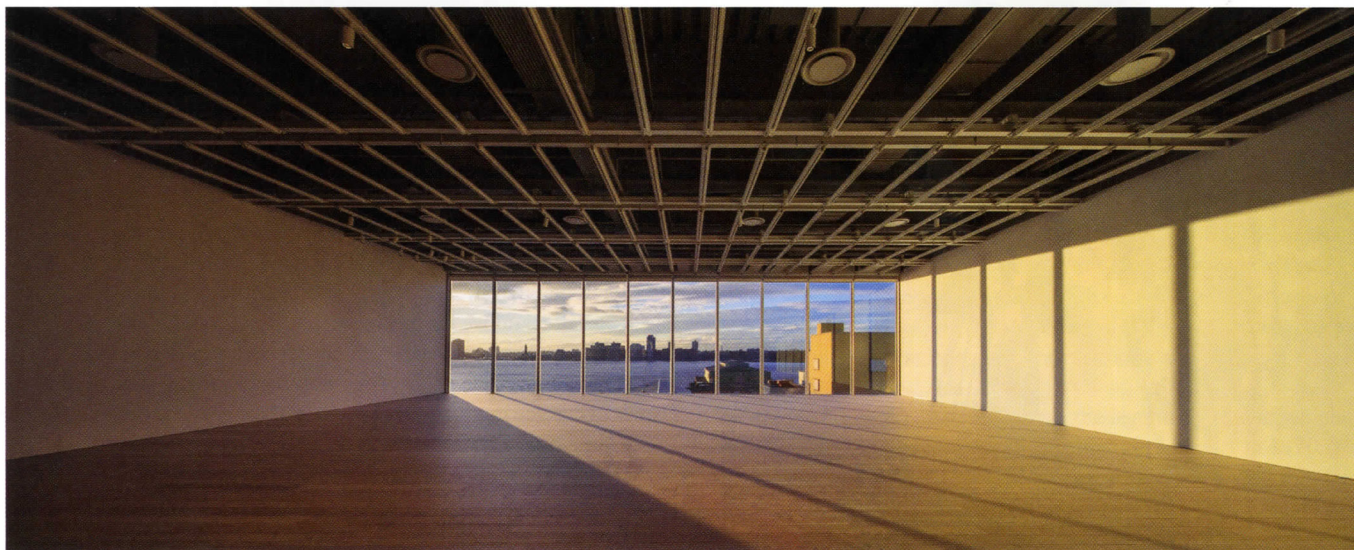
Installation view of the Whitney Museum's fifth-floor galleries, where Andrea Fraser's multichannel audio piece Down the River , 2016, was exhibited.