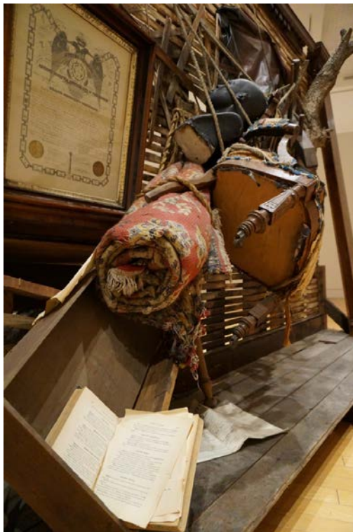
Detail of Titus Kaphar's The Vesper Project