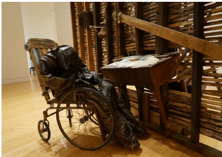
Installation view, Titus Kaphar: The Vesper Project at the Lowe Art Museum, University of Miami