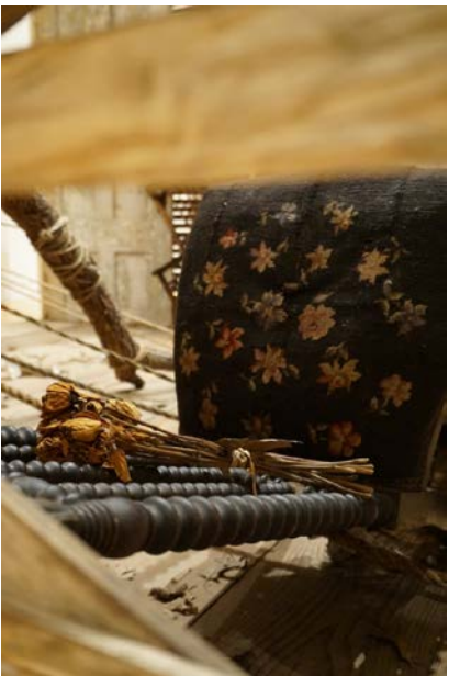
Detail of the house in Titus Kaphar's The Vesper Project