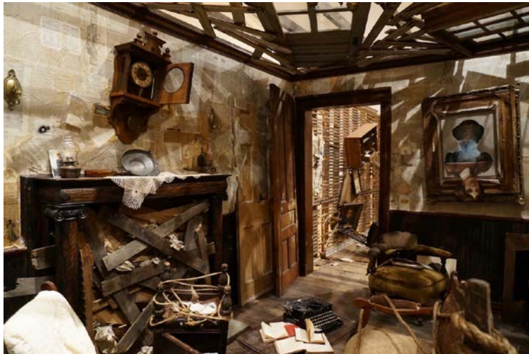
Inside the house in Titus Kaphar's The Vesper Project