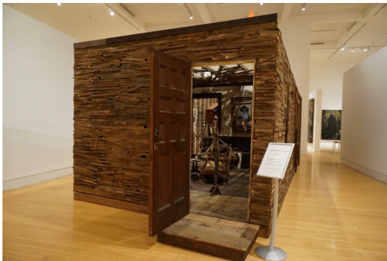
Titus Kaphar: The Vesper Project at the Lowe Art Museum, University of Miami

A wooden shack stands quietly in the middle of the room. It would be unassuming if it weren't taking up most of the white-walled gallery. The shack is a box, set at an angle but neatly contained within the space. It houses inside it two rooms overflowing with tumult.