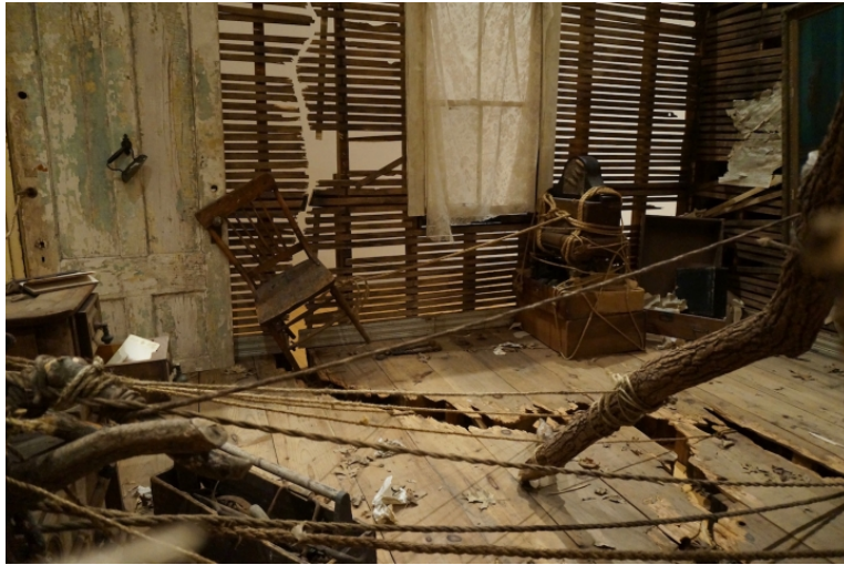
Inside the house in Titus Kaphar's The Vesper Project

The house doesn't tell us which Vespers might have inhabited it or what happened to them, because it doesn't need to — the state of being torn apart is what holds it together.