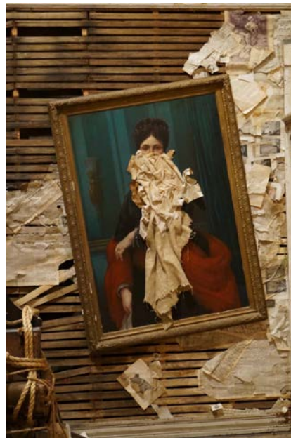
A painting in Titus Kaphar's The Vesper Project