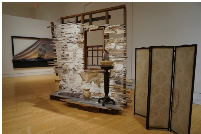
Installation view, Titus Kaphar: The Vesper Project at the Lowe Art Museum, University of Miami