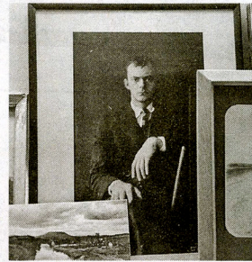
Clockwise from above, a portrait of Cy Twombly; "Untitled (Angled Light)," 1999-2000; and "Untitled (Dancing Cherubs)," 2011-12.

On this day, as in her writing and through her view camera, she stared as squarely as she could, contemplating the passage of time and the transience of life.