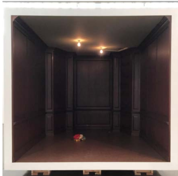
Robert Therrien, No title (paneled room) (2017), via Art Observed

By contrast, another “Room” is covered in wood paneling, giving off a sense of wealth and status that is disrupted by an unexplained series of tambourines sitting on the floor, and the lack of any additional adornments on the walls of the room. In each case, the viewer’s associations and readings are reduced to a small series of visual stimuli, yet barely enough to fully inform the space itself. The result is an environment that both pushes against the viewer’s own readings and constantly holds them at a distance. The resulting space feels strangely empty, as if the viewer was passing through their own memories without any real elements or aspects to truly grab hold of.