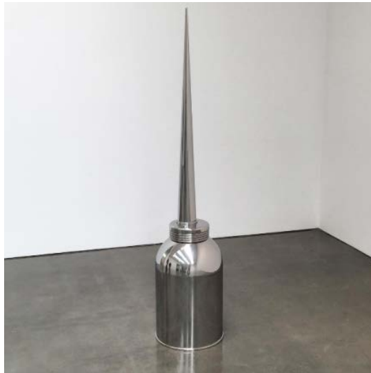
Robert Therrien (Installation View), via Art Observed