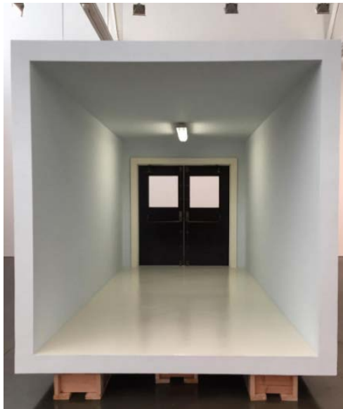
Robert Therrien, No title (room, panic doors) (2013-14)

Therrien's pieces frequently dwell on the intersections of space and form, and the subtle inflections of human interpretation or memory that emerge from these points of intersection. His pieces pull on familiar objects or scenes, and build them up to monumental scale, allowing the viewer a sense of distended familiarity with the works that pushes at extended experiences and frameworks for encounter with the work. These facets of Therrien's work run throughout the show here, using familiar forms such as an immense bow or an oversized oil can, yet uses position and scale to create breaks in the objects' relations with the world around them. A flagpole sculpture in one room, for instance is shaped to give a perspective from far above the ground, as if the viewer were sailing by a flagpole many feet above ground level and looking back down from the top of the pole.