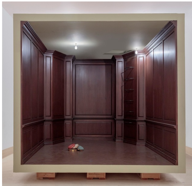
No title (paneled room), 2017; Gagosian Gallery

Known for brilliantly manipulating scale with his giant sculptures of furniture and household objects, Therrien presents a new show (his first in a decade in New York) featuring three free-standing rooms. These meticulously assembled installations—one is lined in dark wood panels with a tambourine on the floor, another is an empty hallway glowing with fluorescent light—are enigmatic and transportive. They beckon viewers to imagine their locations and inhabitants, like finely crafted movie sets awaiting the action.