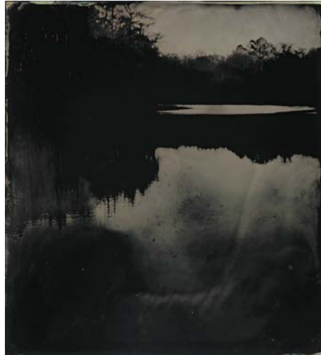
“Blackwater 17,” 2008-2012.

always seen, but not seen, black men on the fringes of white life, mowing, tending bar, or waiting for work in the shade of the big trees at the courthouse.” Who were these men on the margins? Who were the black people who called her “Miss” and her brothers “Master”? To hear these words—the language of subservience, of the supplicant—is to be in an old familiar Southern movie, a black strip of film illuminated by scenes of violence and subjugation: there can only be a master if there is a “nigger.”