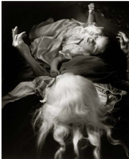
"The Two Virginias #4," 1991.

Mann has written, "Even among the competitive crowd of southern states, Virginia stands out in its obsession with the past. . . . Physically, the reminders are everywhere." Virginia, where the first black bodies to arrive on these shores from Africa landed at Point Comfort, on the James River, after suffering and shitting and losing their respective minds on an English ship named the White Lion—a bitter irony. This was in 1619. At Point Comfort, some of the Negroes' bodies were sold in exchange for food, and some were transported to Jamestown, Virginia's former capital. In 1639, English settlers established the Jamestown Church, one of the oldest houses of worship in America, and in that church they read the Book of Common Prayer and gave voice to their sins during morning prayers and evening prayers—confessing what? The agony of looking at black bodies harvesting tobacco in mineral-rich Virginia soil for profit, and then building churches and families based on all that profit and the dream of more? When the organ played, the