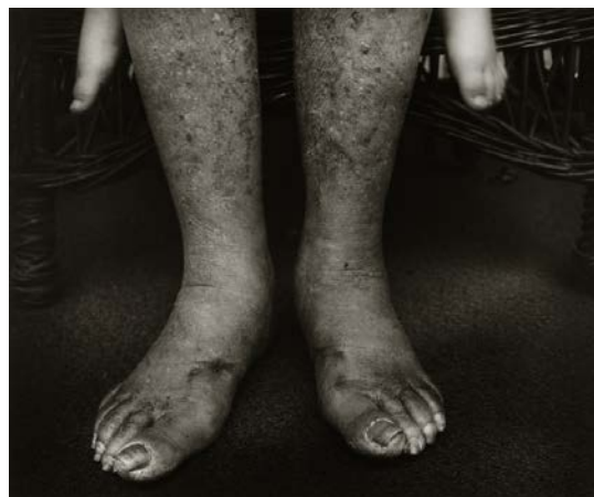
"The Two Virginias #3," 1991. Photograph by Sally Mann

As Mann journeyed into the Deep South, she was guided in part by the Southerner's interest in lore, place, and the ties that bind and abide, along with her willingness to revisit or discover where she had not gone before, to see those places and faces and territories that her eyes saw growing up but maybe hadn't sufficiently registered from the distance of her class and race. It was the world in which her whiteness flourished. She writes, in her memoir, "Hold Still," "I had