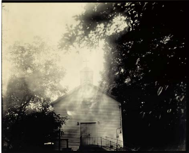
"Oak Hill Baptist 01:01," 2008-2016.

When other helpers fail, and comforts flee, Help of the helpless, O abide with me!