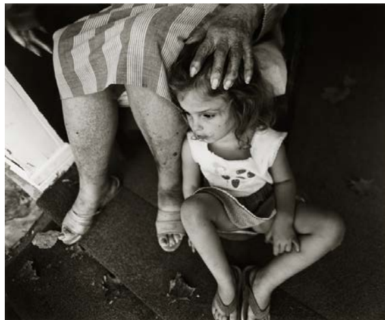
"The Two Virginias #1," 1988.

Who like Thyself my guide and stay can be? Through cloud and sunshine, O abide with me!