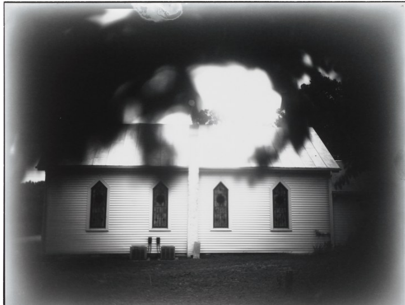
“Beulah Baptist 01:01,” 2008-2016.

We’re in Virginia, where the photographer Sally Mann was born, in 1951, and where she still lives, making work so rooted in place that it is inseparable from history, from lore, and from the effects of slavery. Like Janus, she looks forward as she looks back, at all those bodies that made her and her place in Virginia, and into the landscape, filled with rutted earth, big or low clouds, storybook fantastic vegetation, and the Southern light that reminds so many of photography itself—dark, as Joan Didion wrote, and glowing “with a morbid luminescence.” That entire vision is a part of Mann’s photographs, as she asks in these images of family members, roads, rivers, churches, and the effects of blackness on whiteness and whiteness on itself: Abide with me . And it all does—voices, sounds, the invisible things that Mann’s haunted and haunting photo-graphs allow us to see.