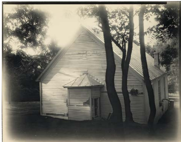
"St. Paul African Methodist Episcopal 01:01," 2008-2016.