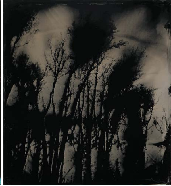
"Blackwater 9," 2008-2012. "Blackwater 20," 2008-2012.