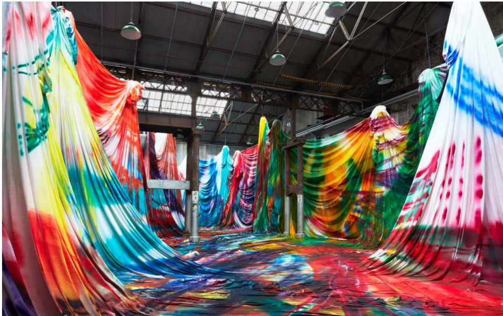
Katharina Grosse, The Horse Trotted Another Couple Of Metres, Then It Stopped, 2018. Exhibition view at Carriageworks, Sydney, 2018. © Katharina Grosse and VG Bild-Kunst, Bonn 2018.

KG: The work doesn't only exist in situ but also in the way we talk about it, in the way we interpret it. With a lot of work, the act of photographing it reduces it so that it can only be seen in a certain way. My work is based on how life is about looking at things from many perspectives – it changes when we look at it in different ways. Unlike Buren's, it is not only the material manifestation of a concept, but the sum of influences upon the concept. And that's where the question of influence becomes interesting.