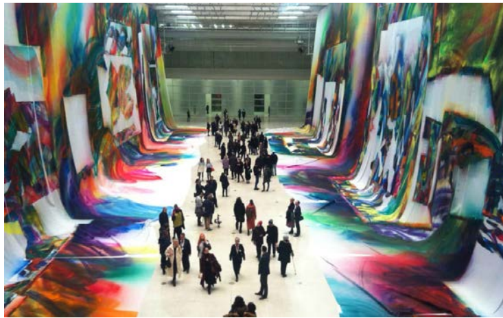
Katharina Grosse, Wunderbild, 2018. Installation view at National Gallery, Prague, 2018.