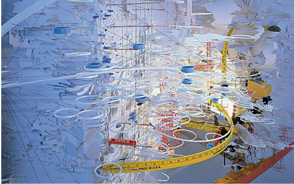
Sarah Sze, Hidden Relief, 2001. Installation view at Asia Society Museum New York, 2001.

HUO: It's perfect that we conclude with these comparisons about the importance of the studio in your practices. This has given us a fantastic insight.