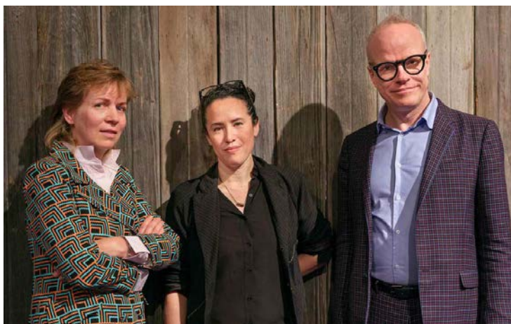
Katharina Grosse, Sarah Sze, and Hans Ulrich Obrist.

Who influences whom? How do artistic kinships develop? When Serpentine Galleries' artistic director Hans Ulrich Obrist asked Katharina Grosse to name an artist who had influenced her, she chose Sarah Sze, who is almost 10 years her junior. The admiration Grosse felt for Sze having first seen her work in an art magazine years ago had endured.