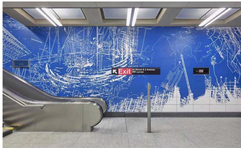
Sarah Sze, Blueprint for a Landscape, 2017. Installation view at NYCT Second Avenue – 96 Street Station, New York City. © Sarah Sze

SS: Both our recent shows were about trying to bring the experience of the studio into the exhibition space.