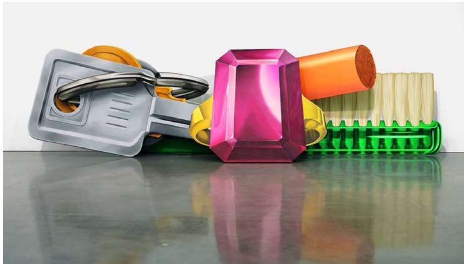
"Still life #61" by Tom Wesselmann, 1976. Oil on shapes canvases (four freestanding sections), 104.5 inches by 391 inches by 79 inches.

If you think paintings are about what's pictured in them, you'll be happily mistaken when you visit "Wesselmann: 1963-1983" at Gagosian Gallery in Beverly Hills.