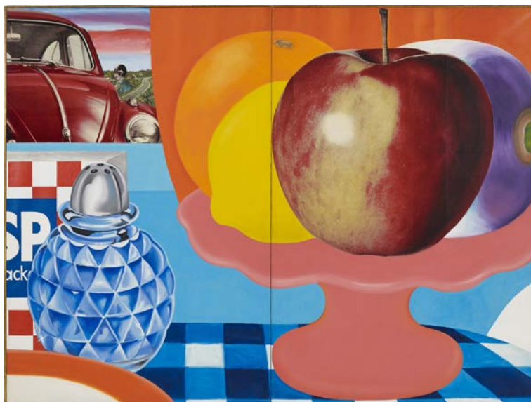
"Still Life #29" by Tom Wesselmann, 1963. Oil and printed paper on collaged canvas, 108 inches by 44 inches.