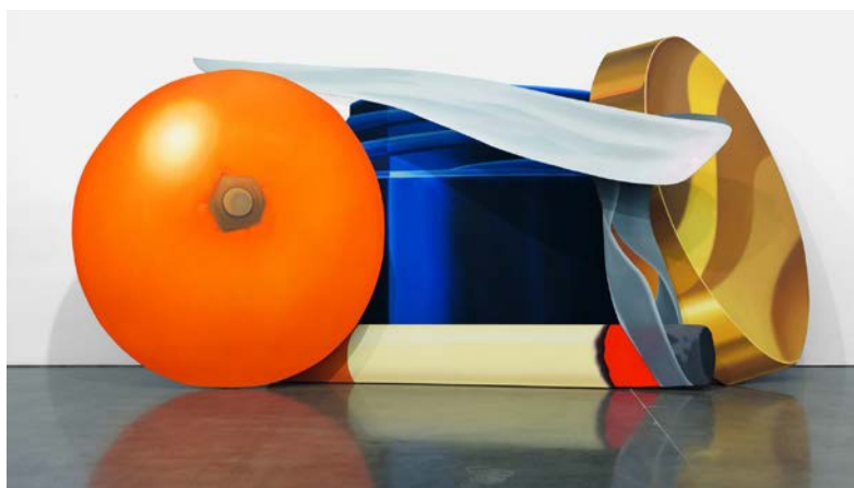
"Still Life With Blue Jar and Smoking Cigarette" by Tom Wesselmann, 1981. Oil on shaped canvases (four freestanding sections), 108 inches by 221 inches by 66 inches.