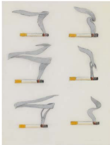
"Six Smoking Cigarettes" by Tom Wesselmann, 1980. Pencil and colored pencil on tracing paper, 19 inches by 12 inches.

Stories are easily imagined. The four objects might be resting, innocently, on a bachelor’s countertop. Or, not so innocently, on the tabletop in a motel room, where a spouse is having an affair.