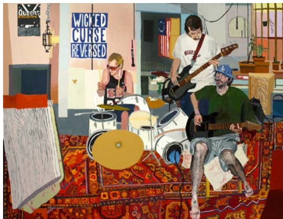
Jonas Wood, Make It Talk, Teodoro, 2006. © Jonas Wood. Courtesy of the artist and Black Dragon Society.

What would you consider your breakthrough moment?