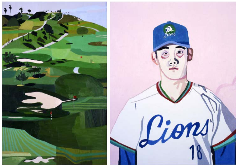
Jonas Wood, Scholl Canyon, 2007. Jonas Wood, Daisuke Matsuzaka, 2007.