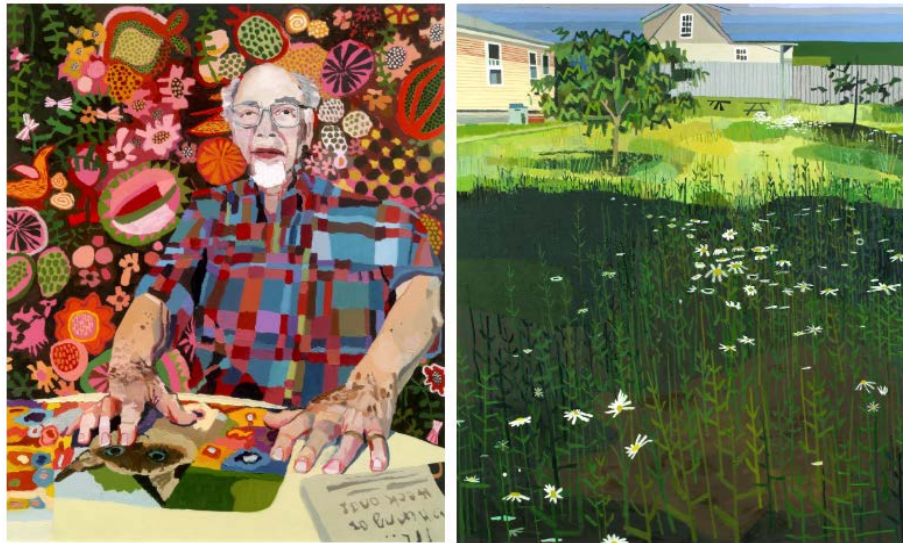
Jonas Wood, Untitled (Rosy), 2006. Jonas Wood, Untitled (M Tree), 2006.

I was just somebody who made stuff. Maybe other people's perceptions were like, "This guy's an artist." But early on, it was just my hobby. I doodled, made colored pencil drawings, took undergraduate art courses. After my junior year of college, I finished my major in psychology and then reconsidered my plan: I always thought I wanted to be a doctor. Instead, I started learning to paint and get better at art. This was around 1999.