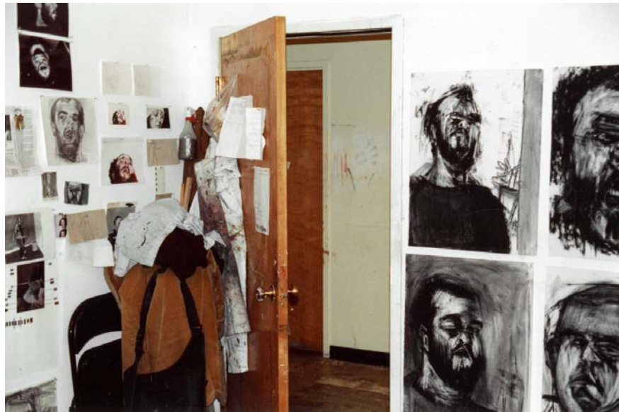
Jonas Wood's graduate school studio, 2001. University of Washington, Seattle, WA.

definitely nepotism. One person was vouching for me. If you look at my work from that time, it was so pedestrian; unrefined and underdeveloped, but I was ready to work.