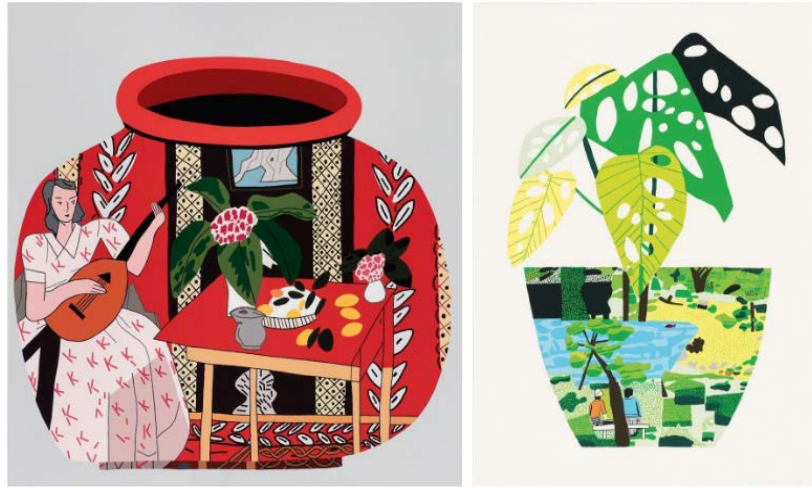
Jonas Wood, Red Pot with Lute Player #2, 2018. Gagolian. Jonas Wood, Landscape Pot with Plant, 2017. Gagolian.

“How I found my style” is hard to answer. I don’t feel like I’m there yet. Even when I’m in a moment of making a lot of things, there’s still this daily practice of putting colors and shapes together and figuring out the balance, adding details, and deciding whether it’s interesting. I’ve had this strategy the whole time that I need to get better—as opposed to thinking that I’m the best. Painting practices are ever-evolving and cumulative. I’m just starting.