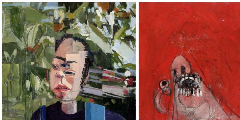
Left-handed paintings. Jonas Wood, Shio with Three Eyes, 2002. Jonas Wood, Untitled, 2002.