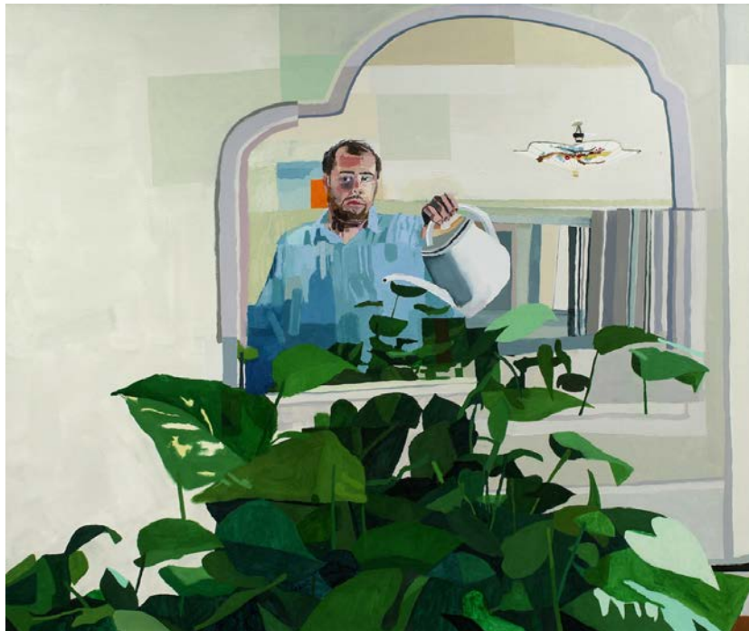
Jonas Wood, Untitled (Self Portrait), 2006. © Jonas Wood. Courtesy of the artist and Black Dragon Society.

Artist Jonas Wood possesses one of contemporary painting's most instantly recognizable aesthetics. His canvases depict plants and ceramics, often on shelves or in lush domestic interiors, rendered with a flattened perspective in vibrant hues. Yet Wood's work is hardly formulaic. His subjects are merely vehicles for skillful, textured mark-making, which evolves year by year.