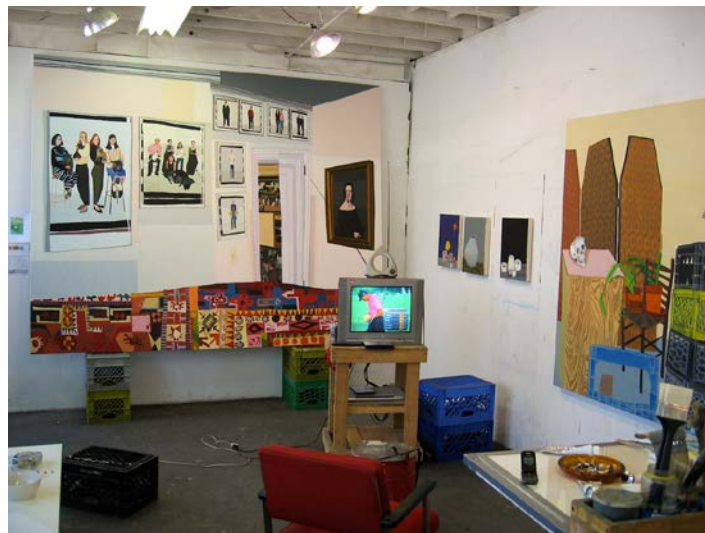
In progress works in Jonas Wood's studio. Compton, Los Angeles, 2007.

The biggest obstacle early on was just not understanding how to put myself back together after grad school and access my power. My grad-school friend said I had a wild horse inside of me, and I needed to learn how to ride it.