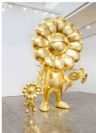
TAKASHI MURAKAMI A Statue of Flower Parent and Child, 2019 Gold leaf on bronze 196 7/8 x 127 1/8 x 91 7/8 inches 500.1 x 322.9 x 233.4 cm Unique version of 3 + 2 APs © 2019 Takashi Murakami/Kaikai Kiki Co., Ltd. All rights reserved

Half an hour before the opening of Takashi Murakami's show at Gagosian Beverly Hills, the line of people waiting in the rain extended for an entire block. The Japanese artist has the standing of a pop celebrity. His exhibition GYATEI 2 , on view to April 23, has most of the identifiable features that support such mass affection. For decades, he has done simple, brightly colored paintings of the chrysanthemum blossom, a motif of traditional Japanese art updated for contemporary viewers.