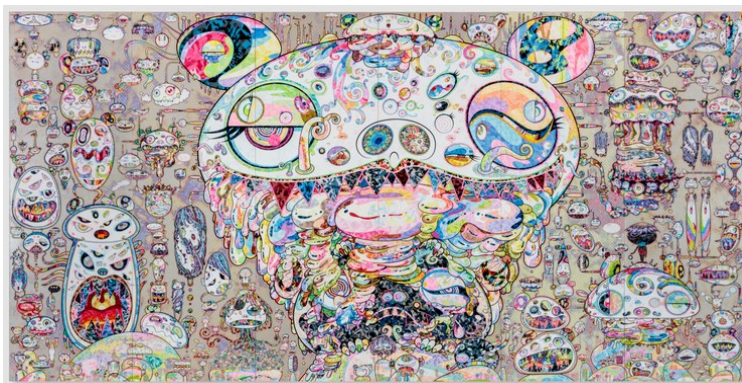
TAKASHI MURAKAMI Tan Tan Bo a.k.a. Gerotan: Having vomited five viscera and six bowels along with a lump of ego, he swallows them back into his empty stomach as everything disperses into the void; along the process he starts his journey into meditation, 2018 - 2019 Acrylic on canvas mounted on aluminum frame 118 1/8 x 236 1/4 x 2 inches 300 x 600.1 x 5.1 cm

Half an hour before the opening of Takashi Murakami's show at Gagosian Beverly Hills, the line of people waiting in the rain extended for an entire block. The Japanese artist has the standing of a pop celebrity. His exhibition GYATEI 2 , on view to April 23, has most of the identifiable features that support such mass affection. For decades, he has done simple, brightly colored paintings of the chrysanthemum blossom, a motif of traditional Japanese art updated for contemporary viewers.