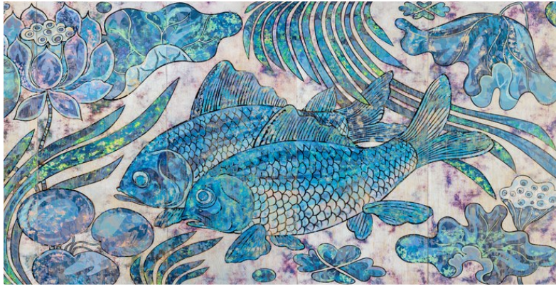
TAKASHI MURAKAMI Qinghua, 2019, Detail Acrylic on canvas mounted on aluminum frame 94 1/2 × 703 inches 240 × 1,785.6 cm © 2019 Takashi Murakami/Kaikai Kiki Co., Ltd. All rights reserved

In scale and silliness, it packs quite a wallop. More gratifying, however, is the self-reflexion, even self-doubt, that permeates much of the other work in the show.