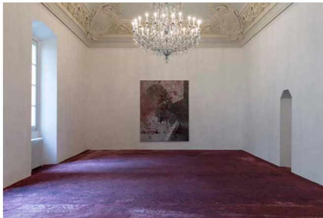
Rudolf Stingel, Installation views Massimo De Carlo, Milano/Belgioioso, (2016).

The artist first came onto the New York art scene in the 1980s and, a few years later, turned heads with his Instructions (1989), a limited-edition manual that explained step-by-step, and in several languages, how to make one of his silver paintings. He also began incorporating unconventional materials, such as folded and creased tulle, into his screenprint compositions before covering over them with silver spray paint.