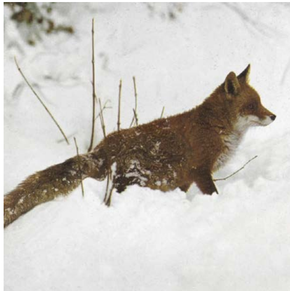
Rudolf Stingel, Untitled (2013). ©Rudolf Stingel.

The show, which features numerous new and never-before-shown works, is the result of a close collaboration between the artist and guest curator Udo Kittelmann, who told artnet News that “Stingel negotiates the state of painting like no other artist in current times.”