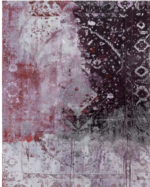
Rudolf Stingel, Untitled (2013).