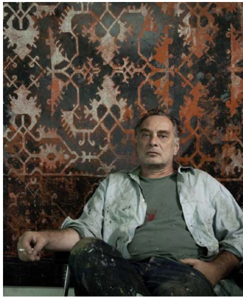
Portrait of Rudolf Stingel.

Audiences and collectors have had a decades-long love affair with the conceptual work of Italian-born, New York-based artist Rudolf Stingel. The reasons for that fascination are on full display in the Swiss city of Basel, where one of the highlights of this week's Art Basel festivities is a major Stingel survey at the Beyeler Foundation.