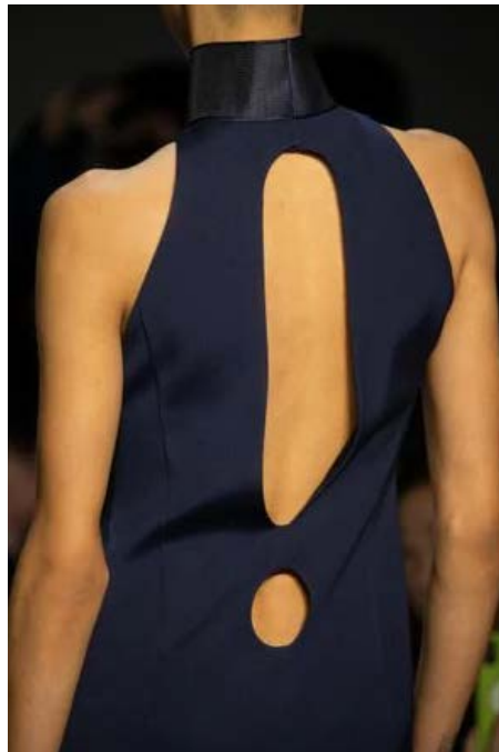
A close-up photo of an Akris gown for fall 2019 with an exclamation point cutout on the back inspired by the work of Richard Artschwager.