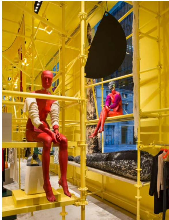
The Calvin Klein store in New York grew out of a collaboration between Raf Simons and artist Sterling Ruby.