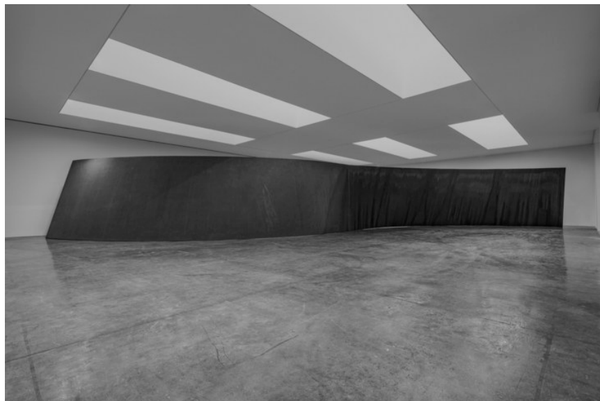
"Reverse Curve," from 2005/2019. © 2019 Richard Serra / ARS, courtesy Gagosian. Photograph by Rob McKeever.

The minimalist intoxication with existing space spurred other artists of the late sixties and early seventies into the wild: Michael Heizer, with "Double Negative" (1969), excavations of two mesas in Nevada; Walter De Maria, with "Lightning Field" (1977), four hundred stainless-steel poles evenly spaced in New Mexico; and Robert Smithson, with "Spiral Jetty" (1970), the eponymous shape, in rocks and dirt, which extends into the Great Salt Lake. Earthworks, as they were termed, were an overshoot, functioning as art mainly by way of documentation or dedicated tourism. (In person, I found "Spiral Jetty" disappointing as sculpture—distinctly not quite big enough for the scale of its setting—though glorious as a subject for photographs that will grace every art-history book forever.)