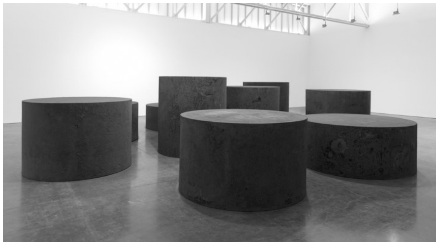
Serra's "Nine," from 2019. The sculptor's work raised the stakes of minimalist confrontation.

Great sculptors are rare and strange. In Western art, whole eras have gone by without one, and one at a time is how these artists come. I mean sculptors who epitomize their epochs in three dimensions that acquire the fourth, of time, in the course of our fascination. There's always something disruptive—uncalled for—about them. Their effects partake in a variant of the sublime that I experience as, roughly, beauty combined with something unpleasant. I think of the marble carvings of Gian Lorenzo Bernini in Rome: the Baroque done to everlasting death. A feeling of excess in both form and fantasy may be disagreeable—there's so much going on as Daphne morphs into a tree to escape Apollo, or a delighted seraph stabs an ecstatic St. Teresa in the heart with an arrow. But try to detect an extraneous curlicue or an unpersuasive gesture. Everything works! Move around. A newly magnificent unity coalesces at each step. You're knocked sideways out of comparisons to other art in any medium or genre. Four centuries of intervening history evaporate. Being present in the body is crucial to beholding Bernini's incarnations. Painting can't compete with this total engagement. It doesn't need to, because great sculpture is so difficult and, in each instance, so particular and even bizarre.