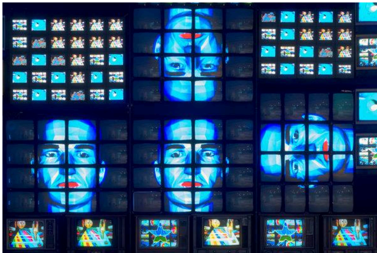
The video has a series of robot-like animated heads, including a solid blue one with red lips. © Nam June Paik Estate, via Whitney Museum of American Art, New York; Ron Amstutz

The grids of smaller monitors around the edges exude layered images and motifs. (Stars reminiscent of the American flag are frequent.) These spin in and out of view, their abstract patterns evoke pulsating electronic quilts.