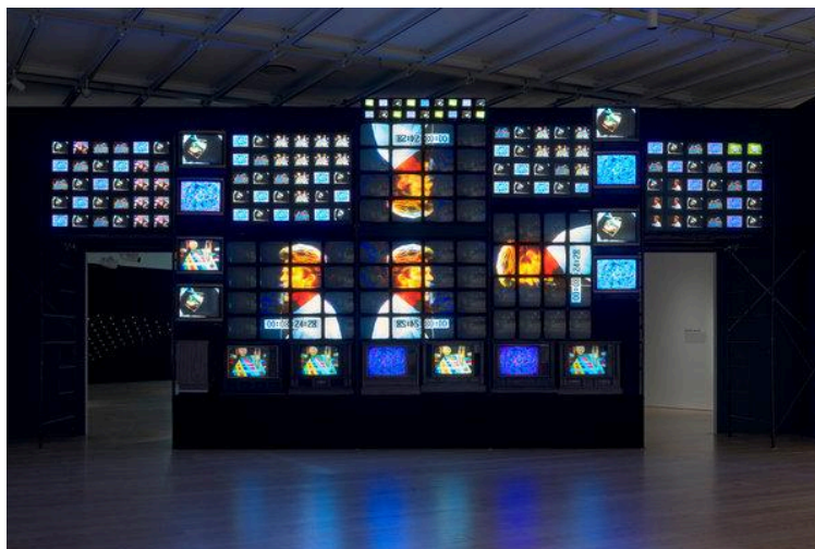
Paik's video features David Bowie singing "Look Back in Anger."