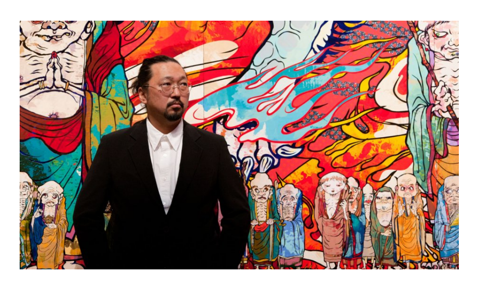
Artwork by © Takashi Murakami/Kaikai Kiki Co., Ltd. All Rights Reserved

An exhibition of all new work by Japanese artist Takashi Murakami, bowing Feb. 21 with a public opening from 6 p.m. to 8 p.m., will be the toast of the Gagosian's annual Oscar bash. The show, through April 13, marks Murakami's first solo exhibition with Gagosian's gallery on the West Coast.