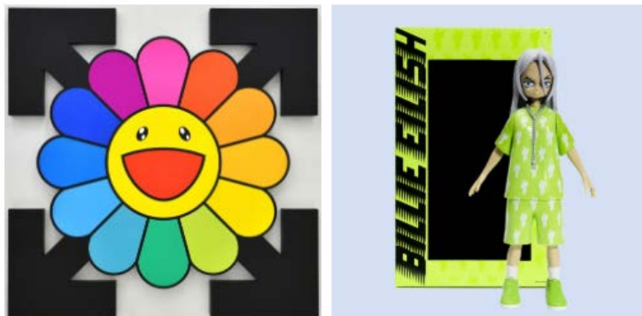
Takashi Murakami and Virgil Abloh, "TIMES NATURE", 2018. Gagolian. Takashi Murakami, BILLIE EILISH, 2019. Dope! Gallery

In 2018, Murakami furthered his ideas about art, merchandise, and collaboration, partnering with superstar designer Virgil Abloh on paintings and sculptures. The pair showed their results at