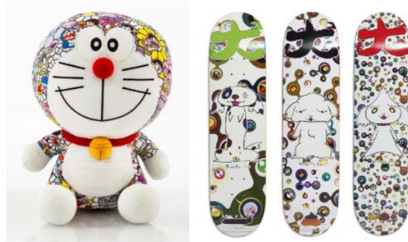
Takashi Murakami X Uniqlo, Doraemon, 2018. Heritage Auctions. Supreme x Takashi Murakami, BunBu-Kun, Ponchi-Kun, Shimon-Kun (set of 3). DIGARD AUCTION

In 2002, Murakami redesigned Louis Vuitton’s monogram (which debuted the following year) and kicked off a years-long relationship with the label, which was then under Marc Jacobs’s direction. Given Murakami’s long-standing desire to merge the commercial and “fine art” realms, and to flatten the distinction between high and low culture, the project was perfectly on-brand for the artist.