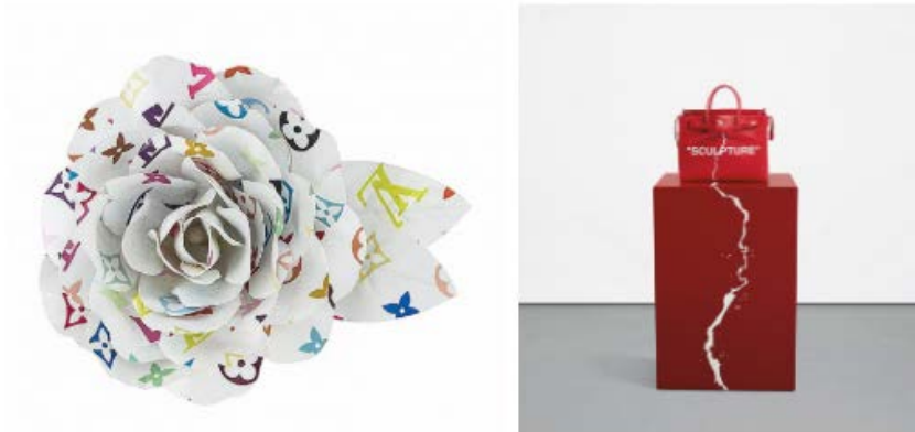
Takashi Murakami, Murakami Vuitton Brooch, 2010. EHC Fine Art Gallery Auction. Takashi Murakami and Virgil Abloh, SCULPTURE, 2018. Phillips

Murakami's high-fashion collaboration quickly seeped into his more "traditional" gallery-bound work. In the early 2000s, he created a series of paintings emblazoned with Louis Vuitton's label. The provocative move raised a series of questions for viewers: Were these branded collaborations or unique artworks? Was this Murakami's work, or that of a luxury lifestyle brand? Could paintings themselves be advertisements for a handbag?