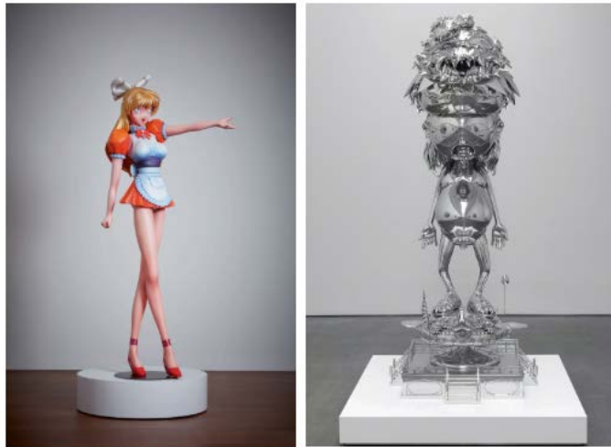
Takashi Murakami, Miss KO 2 Original (Project KO 2), 1997. Takashi Murakami, Invoking the Vitality of a Universe Beyond Imagination, 2014.