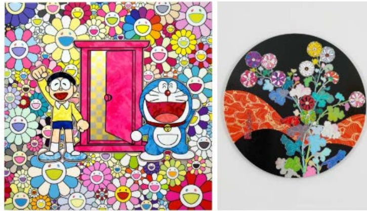
Takashi Murakami, We Came to the Field of Flowers Through Anywhere Door (Dokodemo Door)!, 2018. Gagosian. Takashi Murakami, A Red River is Visible, 2014. Gagosian

Beyond this superficial appraisal of Murakami's work lies the artist's weighty philosophies on art, commerce, and history. Murakami holds a PhD in nihonga , or traditional Japanese painting made after 1900, and his contemporary output critiques elements of the nation's art and culture. But while his works may be based in tradition, Murakami might be more closely associated with more recent Japanese cultural concepts like kawaii (roughly translated to "cute") and otaku (young people obsessed with computers at the expense of social interactions).