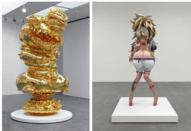
Takashi Murakami, The Birth Cry of a Universe, 2014. Gagosian. Takashi Murakami, 3m Girl (Original rendering by Seiji Matsuyama, modeling by BOME and Genpachi Tokaimura, full scale sculpture by Lucky-Wide Co., Ltd.), 2011. Gagosian.

Among his sculptures are his famous, record-breaking My Lonesome Cowboy and its counterpart, Hiropon (1997). Both oil-and-acrylic-fiberglass works feature hypersexualized, cartoonish figures, blown up to larger-than-life scale (they reach around eight and seven feet tall, respectively). The nude, blond Cowboy twirls a lasso of his own semen, while the female Hiropon , wearing only a tiny green bikini top, appears to be jumping a "rope" made from her breast milk.