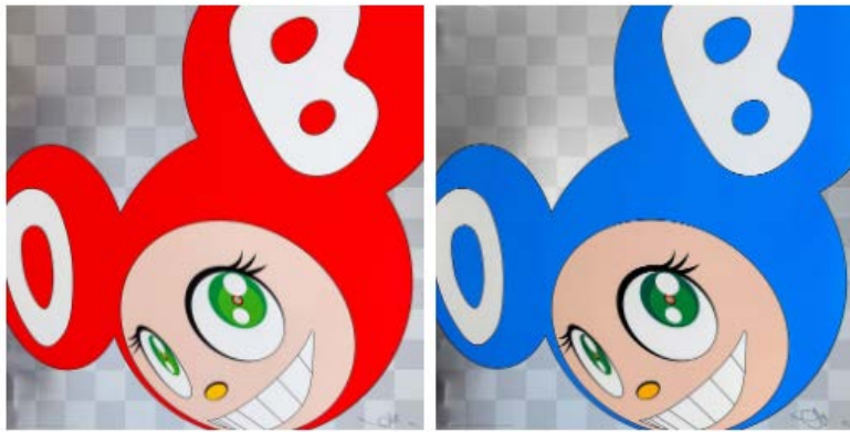
Takashi Murakami, And then and then and then and then and then and then (Red), 1999. Gagosian. Takashi Murakami, And then and then and then and then and then and then (Aqua), 1999. Gagosian