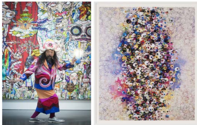
Takashi Murakami, MCA Chicago. Takashi Murakami, Who's afraid of red, yellow, blue and death, 2011.

Takashi Murakami has one of the most expansive practices in contemporary art. Aided by Kaikai Kiki, a global studio of workers and budding artists centered in Tokyo, Japan, the renowned Japanese artist makes an expansive amount of work that riffs on his native country's anime and manga traditions. Masses of bright flowers with smiling faces are a common motif, as are flattened cartoon figures, all rendered to a simultaneously adorable and disconcerting effect. Murakami's signature "Kiki" figure, for example, features two fanged teeth and a third eye. Over the past three decades, Murakami has repeated and distorted such characters across all manner of media.