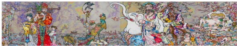
Takashi Murakami, One encounters a multitude of hardships and disasters along the way to the netherworld, yet this process allows one to take the proper form of a human being and thus attain Buddhahood, 2018. Gagosian.

Murakami began rendering spiritual figures as well—though not for the first time in his career. Spiritual, mythological, and personal symbolism are a decades-long interest for the artist. Before he turned to anime and manga influences, he’d actually been making paintings of fish, referencing both Chinese porcelain vases and his own childhood memories of watching fishermen and catching fish with his father. In 2019, he notably returned to this early theme for a giant ocean-themed wall mural, titled Qinghua, for Gagosian Beverly Hills.