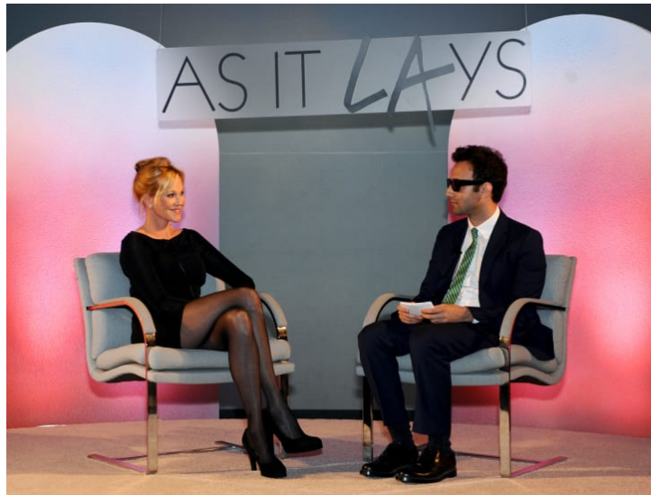
Melanie Griffith and Alex Israel attend MOCA Screening and Performance of "As It Lays" by Alex Israel at Henson Studios on May 19, 2012 in Los Angeles, California.

For the last decade the artist has forged a close relationship with Warner Bros. Studios, including working in the scene-painting workshop on the lot. The unusual arrangement has helped Israel establish a symbiotic relationship with the industry that he idolizes, including exhibiting old props in galleries as readymade artworks, and projecting the bat-symbol from Tim Burton's "Batman" (1989) from Le Corbusier's brutalist Cité Radieuse, an architectural landmark in Marseille.