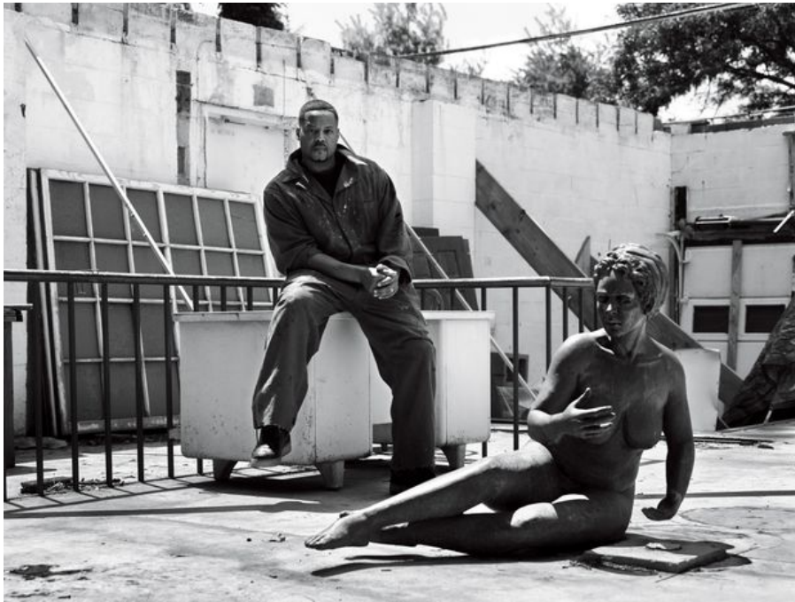
PLEIN AIR Kaphar behind his studio, with a found sculpture.

The energy Kaphar puts into everything he does reveals a man ambivalent about his crafted persona—more frustrated, more angry, more anxious about spectacle and far less hopeful than he initially seems. “It’s not my responsibility to make you feel hopeful about the future,” he says, speaking to an imagined public. “I’m glad you’re doing your antiracist work, but that’s your work. I’m trying to figure out how to heal right now. I’m trying to figure out how to make sure my brothers are OK. I’m worried about my sisters. I’m trying to console my mother.”