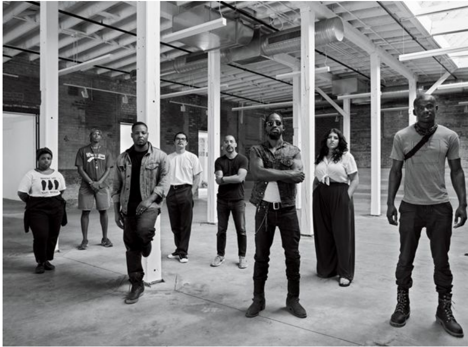
ART PROJECT Kaphar with members of his NXTHVN residency and training program. “Most institutions infantilize artists,” he says.

Kaphar is known for creating aesthetic counter-narratives that blend the historical and the topical, but he felt fatigued, as he writes in Time , by “listlessly wad[ing] through another cycle of violence against Black people.” He explained to the magazine that his current body of work addressed Black mothers and sent a photograph of what he had been working on since early 2020, a large painting called Analogous Colors .