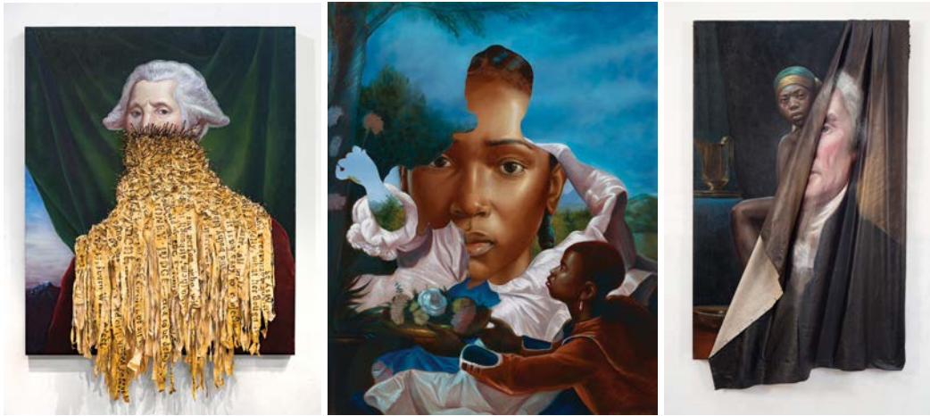
Absconded from the household of the President of the United States, 2016, which highlights George Washington's slave-ownership. © TITUS KAPHAR. COURTESY THE ARTIST AND GAGOSIAN. YALE UNIVERSITY ART GALLERY PERMANENT COLLECTION. Seeing through time, 2018. © TITUS KAPHAR. COURTESY THE ARTIST AND GAGOSIAN. Thomas Jefferson shown in Behind the Myth of Benevolence, 2014. © TITUS KAPHAR. COURTESY THE ARTIST AND GAGOSIAN

again,” says Kaphar. When he was 15, he says he was living with his father when an altercation led him to leave home, eventually finding stability with a family in San Jose, California.