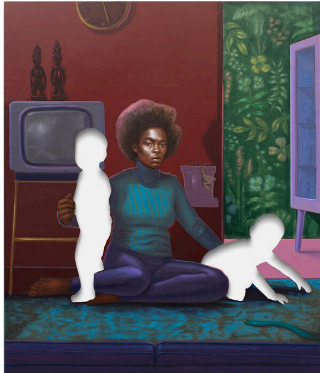
“Twins” (2020) imbues a vintage television set and a garden hose with historical meaning.

Mr. Kaphar’s aesthetic efforts walk along an unusually fine line between art and activism. Among his best-known works (not in this show) is “Behind the Myth of Benevolence” (2014), in which a careful, flipped replica of Gilbert’s Stuart’s portrait of Thomas Jefferson has been partly removed from its stretcher and hangs to one side, like a drawn-back curtain. Behind this, solidly attached to the stretcher, is a second canvas and another layer of the great man’s personal history: an intimate portrayal of a beautiful young Black woman. Her image refers to Sally Hemings, an enslaved woman of mixed race who belonged to Jefferson, and whose six children were in all likelihood fathered by him.