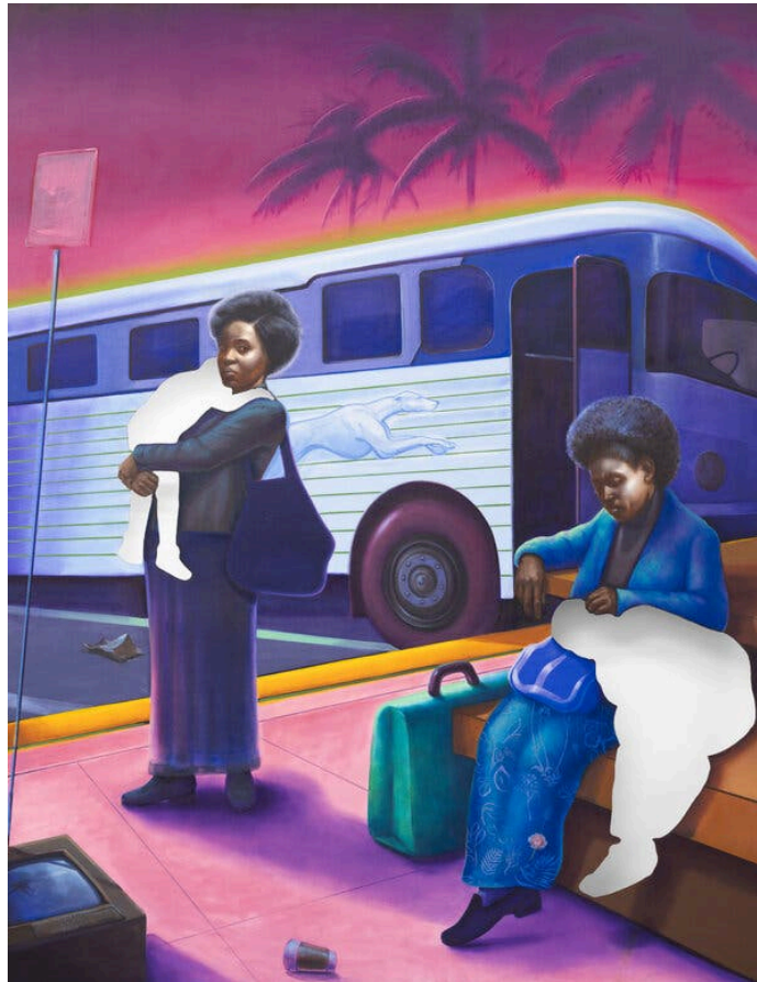
Titus Kaphar's "The distance between what we have and what we want," 2019, is in a show of new works, "From a Tropical Space," at Gagosian.

Titus Kaphar's paintings have always been blunt in confronting both the paucity of Black figures in traditional Western art and the tragic inequities of Black life in the United States. Mr. Kaphar accomplishes this by being a skilled realist painter adept at violating his medium in startling ways to make his points, whether by tearing or cutting his canvases, or covering parts of his images with tar or whitewash. His paintings are conceptual objects freighted with historical or present-day references that require little explanation. They verge on didactic except for the visual richness and emotional directness with which they examine their entwined subjects.