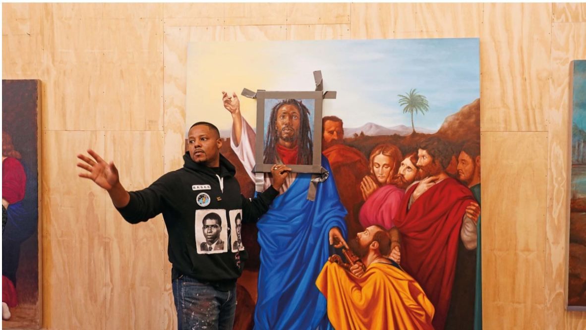
LIFE IMITATES ART. KAPHAR'S JESUS NOIR (2020).

“As soon as I agreed to do the TIME cover, I immediately started to regret it. I didn’t think through how accessible I would feel,” Titus Kaphar confesses while seated on a stool, applying swift, careful strokes to the unfinished crowd in a basketball-related tableau titled Ascension IV on his studio wall. “I did not regret making the painting that is on the TIME cover or writing the poem that accompanies it,” he clarifies, eyes trained on the composition before him. “Those are real. I did regret how vulnerable I suddenly became, public in a way I’ve never been before.”