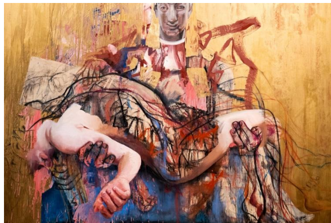
Saville's "Byzantium" (2018)

Her work reflects the grand ambitions of Renaissance masters, yet against their sensual, divine nudes, Saville presents images of fleshy, earthly women, sometimes with bruised or ruptured skin — not the body beautiful, but the suffering, anxious and impermanent body.