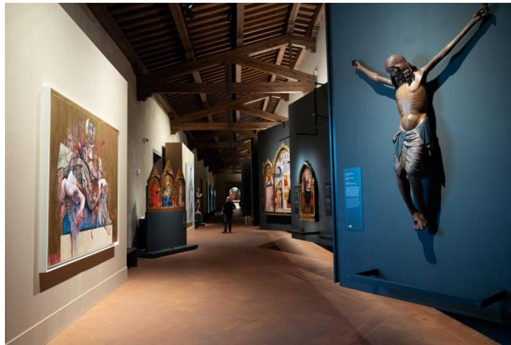
“Byzantium” on display in the Museo degli Innocenti, among works from the museum’s collection.

Those fearless canvases ignited her career in the 1990s and established her place as a trailblazer of figurative painting’s renewed relevance. By 2018, when “Propped,” a seething, distorted naked self-portrait, came up for sale at Sotheby’s, it fetched $12.4 million, an auction high for a work by a living female artist.