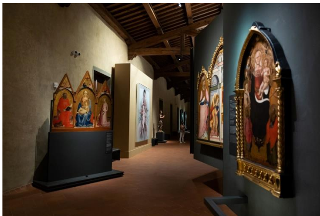
Second from left, Saville’s “The Mothers” (2011) at the Museo degli Innocenti.

All of these really poignant things were happening to me, and at the same time, I took on the social categorization of “mother,” when I had spent my life trying to be taken seriously as a painter. I had a debate with myself about whether I should reveal motherhood as a subject in my work. And then I thought, “Why wouldn’t I do that? I do that about every other subject. Why would I feel hesitant? Is it because I think it could affect my career?”