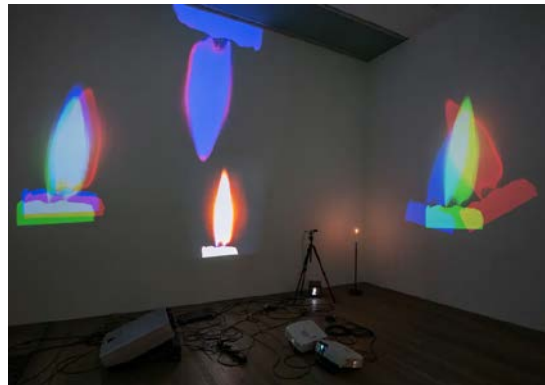
"One Candle (Candle Projection)," 1989.