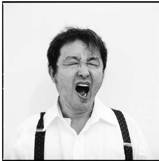
Roman Mensing's "Nam June Paik, Yawning." (© Roman Mensing/Artdoc.de)

Artists are not prophets, except occasionally by dumb luck. Just because they explore new ways of doing things doesn't mean they can see into the future. To romanticize them as seers — as when, for instance, we praise Picasso's portrait of Gertrude Stein for supposedly anticipating how Stein would age — is to misunderstand their role. The job of the artist is not to foretell the future; it is to see the present with fresh eyes.