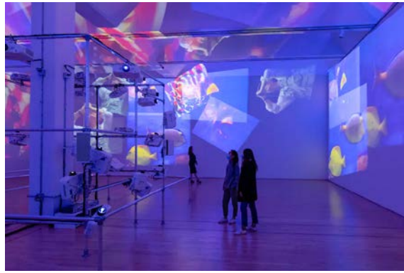
"Sistine Chapel," 1993.