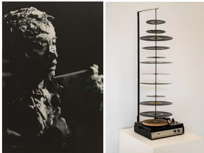
“Paik mit Rasierschaum, Originale, Köln (Paik with Shaving Cream, Originale, Cologne),” 1961. “Record Shishkebab,” 1963/1979.