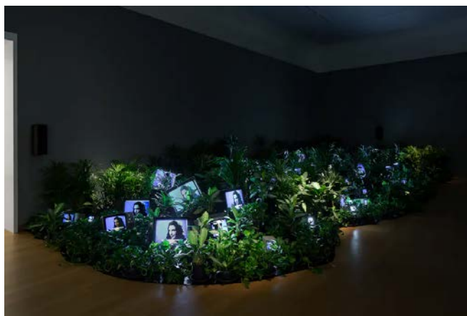
"TV Garden" (1974). (Peter Tjihuis/Kunstsammlung Nordrhein-Westfalen, Düsseldorf/© Estate of Nam June Paik)

But the style of display tends to drown out the side of Paik I'm most drawn to: his attempts — sometimes halfhearted, sometimes almost desperately sincere — to recoup some form of inner life from the boiling broth of noise and distraction in which we find ourselves plunged every morning — often before we've even looked out the window or made it to the bathroom.