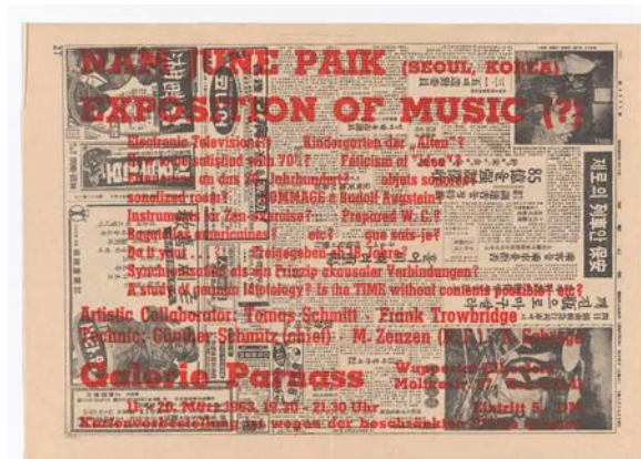
“Exposition of Music- Electronic Television,” 1963.

the 1950s at North Carolina's Black Mountain College by Cage, Robert Rauschenberg and Merce Cunningham (all of whom ended up collaborating with Paik).