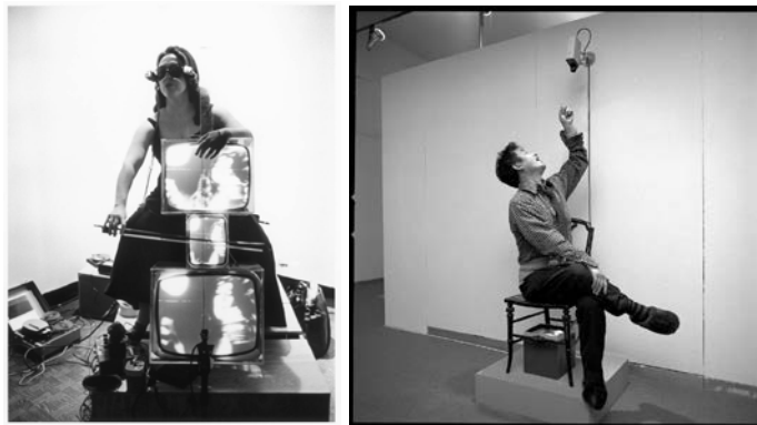
“Charlotte Moorman With TV Cello and TV Eyeglasses,” 1971. Nam June Paik sitting in “TV Chair” in 1976.

If that's a drag, the star-studded cast of Paik's collaborators keeps you engaged: Besides those already mentioned, it includes Lou Reed, Issey Miyake, Allen Ginsberg, Keith Haring, Philip Glass, Laurie Anderson, Joseph Beuys and Peter Gabriel. There's also a whole section devoted to Paik's long-term collaboration with the cellist Charlotte Moorman. Their partnership, combining avant-garde music and performance art with technology, became a media sensation thanks to Moorman's willingness — underwritten by her sardonic, sensation-seeking intelligence — to shed her clothes.