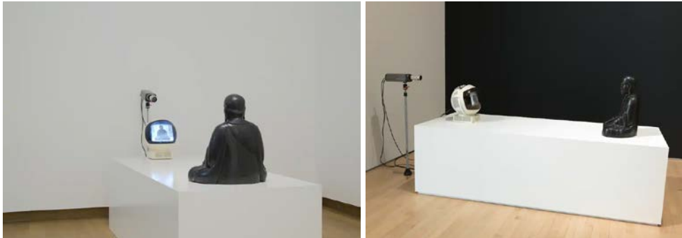
"TV Buddha," 1974. (Stedelijk Museum Amsterdam/© Estate of Nam June Paik) "TV Buddha" from another angle. (Stedelijk Museum Amsterdam/© Estate of Nam June Paik/Photo: Katherine Du Thiel)

Paik's most famous work — "TV Buddha" — has been installed in the first room at SFMOMA. It shows an 18th-century wooden sculpture of a seated Buddha, which Paik purchased at an antique store. The Buddha is being filmed by a CCTV camera. The live feed appears on a spheroid TV that looks like an astronaut's helmet and directly faces the Buddha.