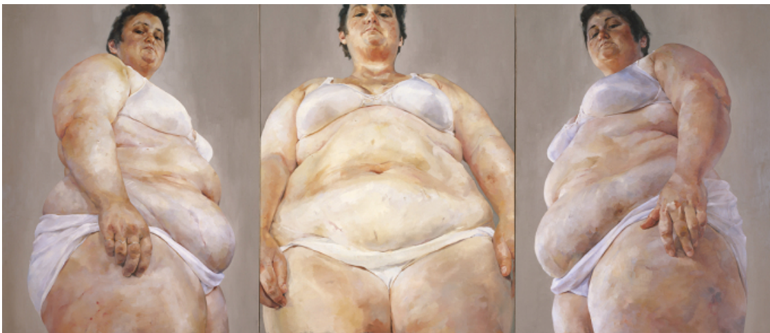
Jenny Saville, Strategy, 1994, oil on canvas, in three panels, 108 x 250½ inches. PHOTO PRUDENCE CUMING/COURTESY GAGOSIAN/©JENNY SAVILLE