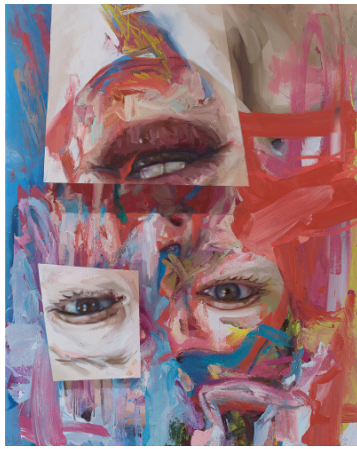
Saville: Virtual, 2020, oil on canvas, 78¾ by 63 inches.

SAVILLE: I just showed about half the works from my “Elpis” series at Gagosian in New York, and I’m finishing the other ones now. When I went to Moscow two years ago, I saw so many amazing women—like this waitress who had an incredible face. Eventually, I started asking people if they’d model for me, and rented a studio there. The series is based on the Russian female poet Anna Akhmatova, who wrote the bulk of her work in the ’30s and ’40s, under Stalin’s rule. Her husband was executed by the Soviet secret police, and her son was imprisoned. Every day, for seventeen months, she went to the prison where he was kept and saw all these other women who were walking around trying to find information about their loved ones. She couldn’t write anything critical of the government—had the work been found, she would have been arrested or executed—so instead, she whispered the poem she wanted to write into these other women’s ears. Between 1935