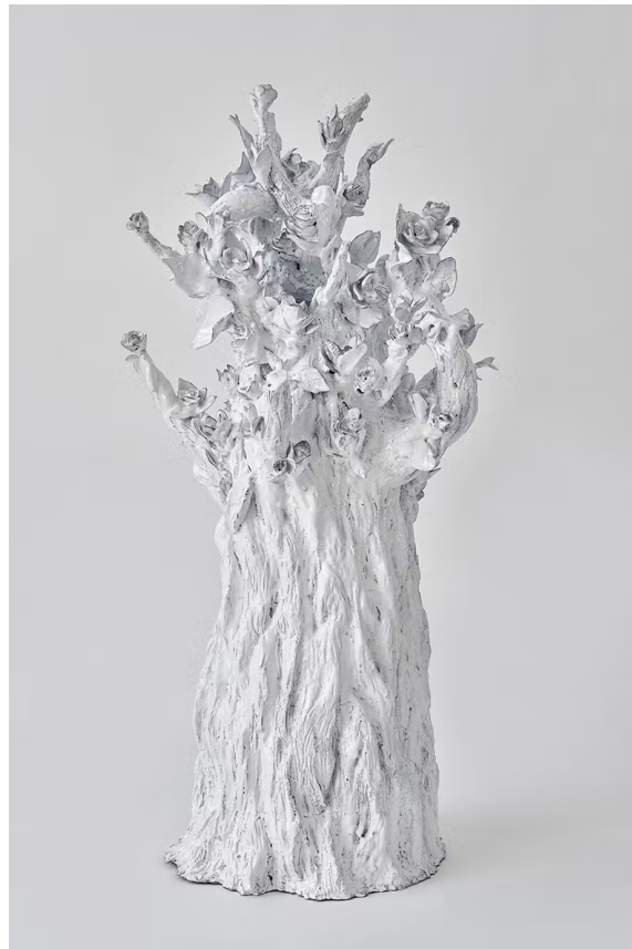
Magnolia I (2022), Setsuko.

I start the day with a special kind of Japanese tea, or sometimes [hot] chocolate which I bring from Switzerland, or coffee. There's a very good coffee machine there. I also make a light breakfast in the studio and then I start working.