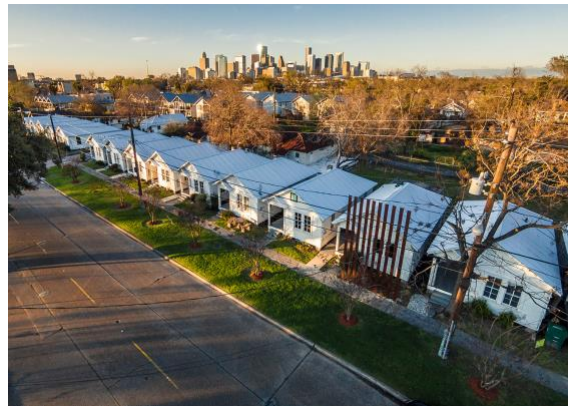
Project Row Houses, Houston 1993–2018

What’s Next: Recently signed with mega-gallery Gagosian , which will present his first-ever New York solo show in September, Lowe will participate in the Whitney Biennial in April.