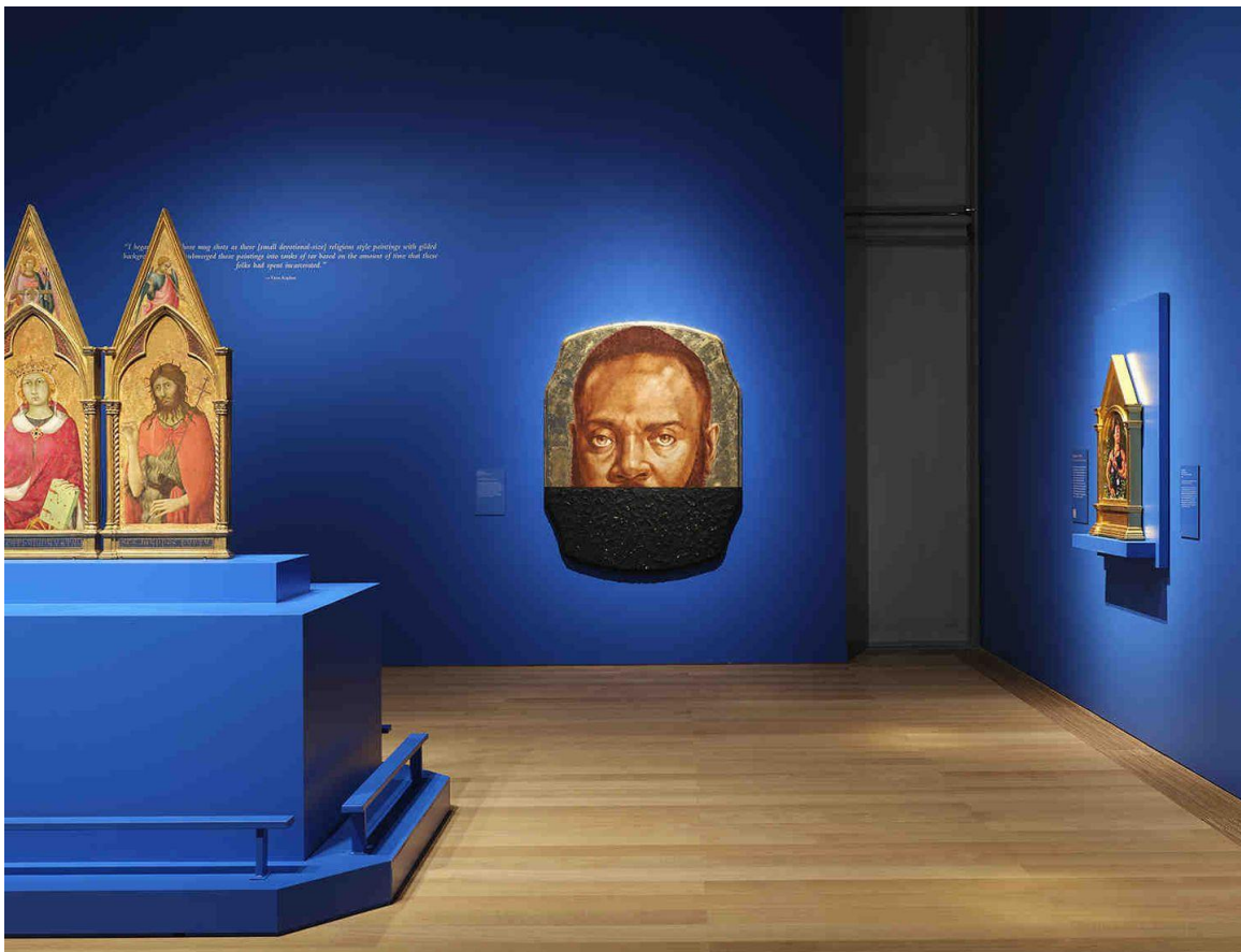
From left: Works by Simone Martini, Titus Kaphar, and Kehinde Wiley in "Metal of Honor: Gold from Simone Martini to Contemporary Art," 2022. Isabella Stewart Gardner Museum, Boston.