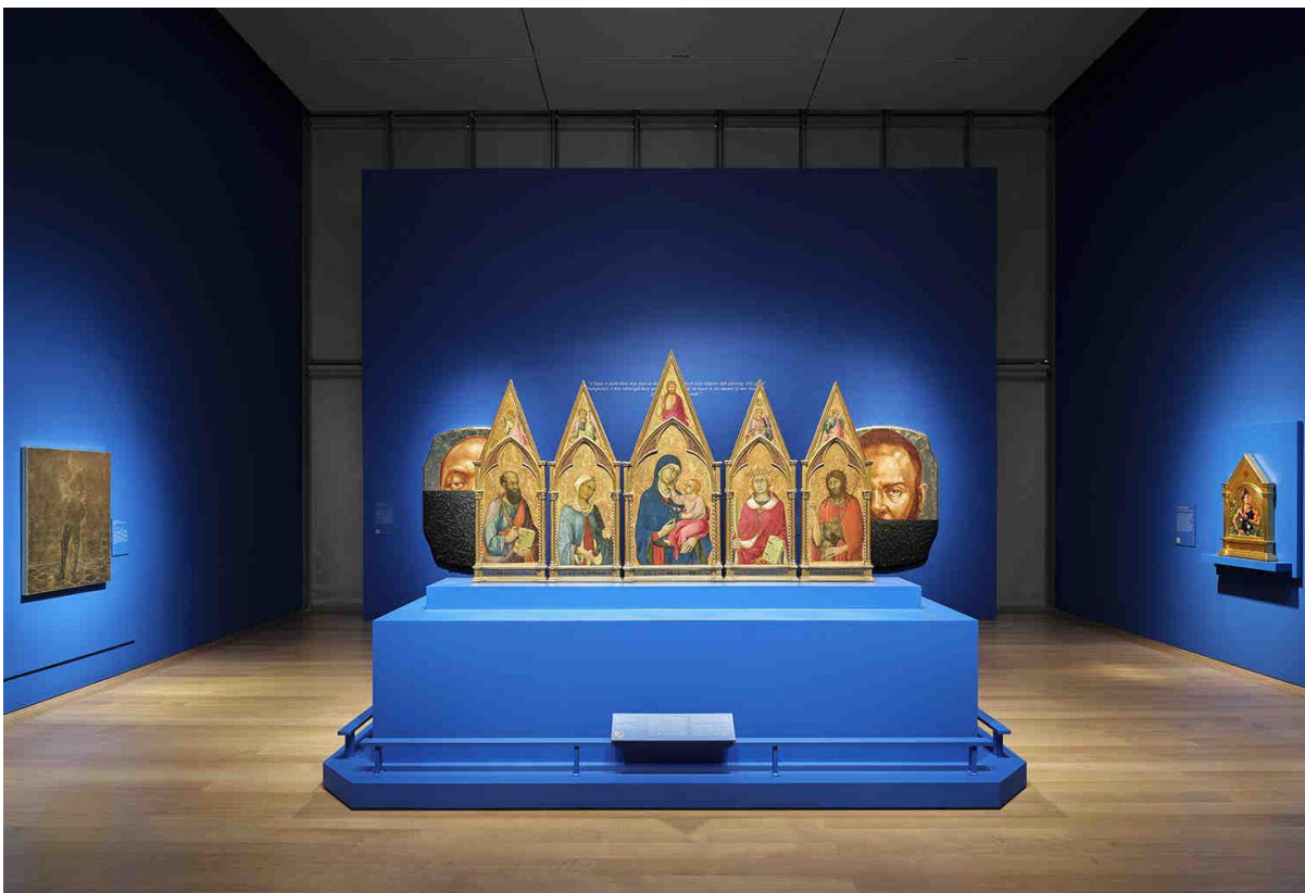
"Metal of Honor: Gold from Simone Martini to Contemporary Art," installation view, 2022, at the Isabella Stewart Gardner Museum.

If the one and only accomplishment of the Isabella Stewart Gardner Museum's new exhibition is to bring its shimmering 14th-century, five-panel altarpiece by Simone Martini down from its permanent perch high on the wall in the museum's Italian room to eye level and table height, it wins. For maybe the first time, you can really see it — up close and from all sides — for the astonishing, gilded masterpiece that it is.