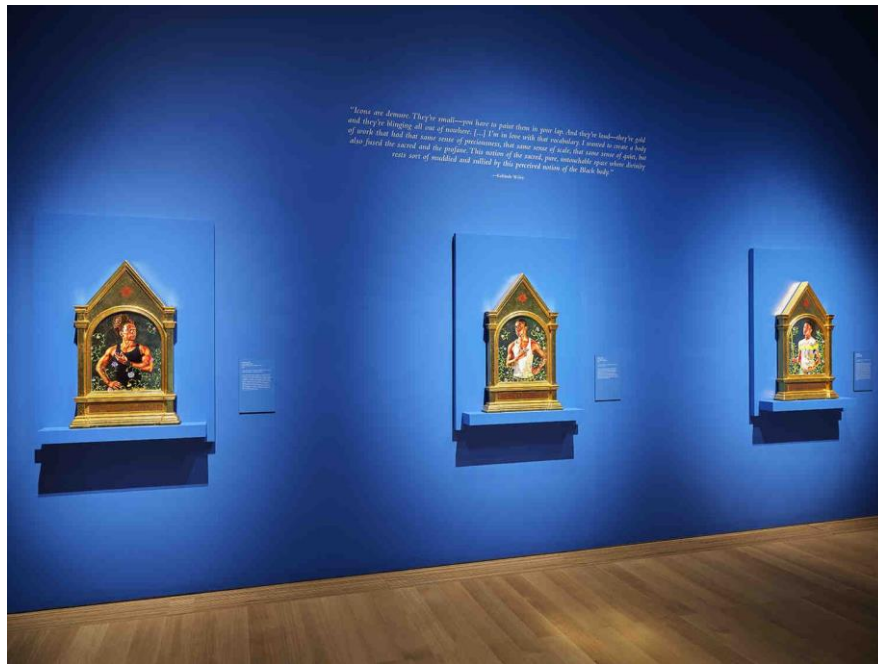
Works by Kehinde Wiley in "Metal of Honor: Gold from Simone Martini to Contemporary Art," 2022, at the Isabella Stewart Gardner Museum.