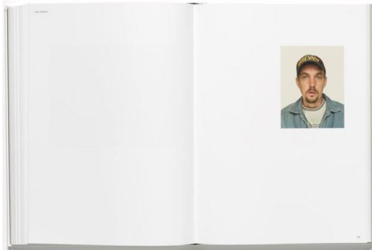
Spread from Taryn Simon, The Innocents, 2022

woman in Hanover, Virginia, is convicted by an all-white jury based on testimony that the individual who committed the crime “bragged” about having a white girlfriend; a former altar boy managing a Pizza Hut in Austin, Texas, is threatened with execution and shown pictures of the death chamber in Huntsville by his interrogators and confesses to a murder in exchange for a life sentence. Wrongful convictions can happen to anyone, and they do, but they are far more likely to happen to someone who is poor, Black, Brown, or has an intellectual disability or mental health condition.