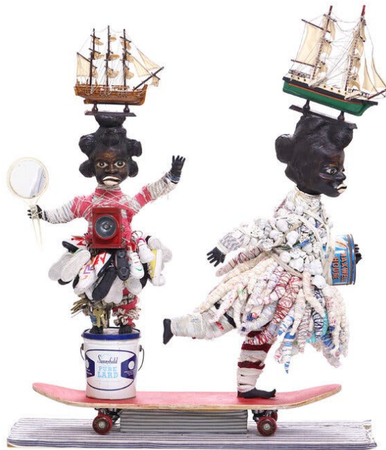
Vanessa German’s “2 ships passing in the night, or i take my soul with me everywhere i go, thank you” (2014), in which two Black girls created from found objects carry model ships on their heads. Credit...Vanessa German and Petrucci Family Foundation Collection of African American Art

“Arrivals” is, at heart, about identity, which is on trend for today’s art world. What makes it refreshing is that it uses a historical framework to take up a familiar subject. The show isn’t about race, ethnicity, or gender, though it touches on all those things. It’s about how artists can help bolster, complicate, or puncture national myths through their own stories and observations.