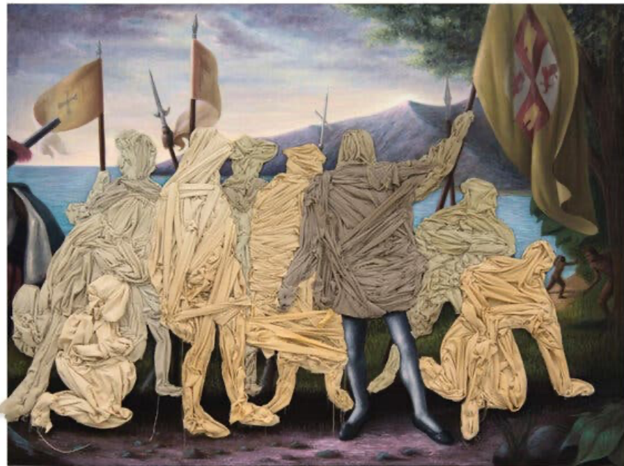
Titus Kaphar's "Columbus Day Painting" (2014), from the exhibition "Arrivals" at the Katonah Museum of Art. In a bit of revisionism, he replaces Columbus and his colonialists with blank, bunched canvas, muting the notion of heroism. Credit...Titus Kaphar

The United States has a vexed relationship with immigration. A core narrative of our country is that it is a melting pot, even though our government has excluded different groups of migrants for centuries. The much-vaunted nickname " nation of immigrants " leaves out those who were here before colonization (Native peoples) and those who were brought here against their will (enslaved Africans). There's a gap, in other words, between the romantic image of America