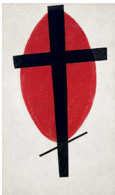
"Mystic Suprematism," 1920–27. Oil on canvas. 393/8 x 235/8". Collection of the Heirs of Kazimir Malevich.

At the outset of Modernism, geometric shapes in painting and sculpture were being foregrounded by the Western avant-garde—in Russia with the Suprematists and Constructivists, in Holland with the De Stijl movement, and in Germany with the Bauhaus. Other important sources can be found in the early mystical color experiments by Frantisek Kupka and Hilma af Klint. Among those who worked in geometric abstraction at this time, a certain balance and visual tension was perpetuated between spiritual (mystic) expression and social utopia as evidenced by the containment of form within these artists' works. Much of this was based on the notion that balance and tension were complementary to one another and that a proper dosage of each was necessary in order for a painting to function both socially and spiritually. This idealism was shared reciprocally by painters, sculptors, and architects alike.